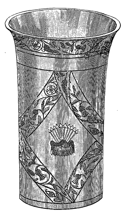
Fig. 1. Communion Cup of the Scots Church, Campvere (scale one-half).

under the Scottish standard, but is quite equal to that of most of the silver plate which comes from the Netherlands.