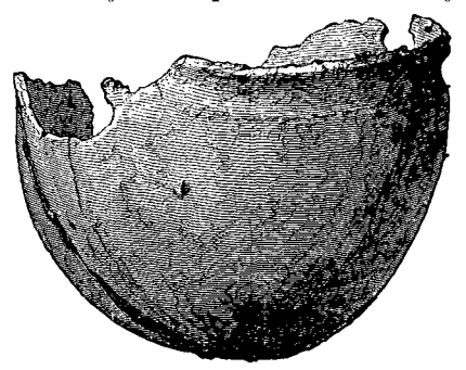
Fig. 5. Globular Vessel of Cast Bronze. 1.

as it came from the mould, the superfluous metal along the line of the junction of the two halves of the mould, and many small protuberances, due to porosities or accidental hollows in the sides of the mould, remaining uncleaned away. The probable reason why the casting had