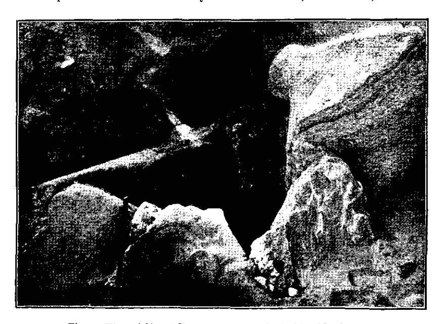
Fig. 1. View of Cist at Easterton of Roseisle, looking North-West.

sizes. The flat stones at the sides were thickish slabs of sandstone, on which were built similar slabs, all of them unshapen, and the height was about 3 feet. There was only one upright stone about 4 feet high. The sculptured stone (figs. 3 and 4), set on edge, with the mirror, sceptre, &c., facing the interior, formed the west side. Although the cist had been first opened in December 1894 by Rev. Mr M'Ewen, F.S.A. Scot., and Mr