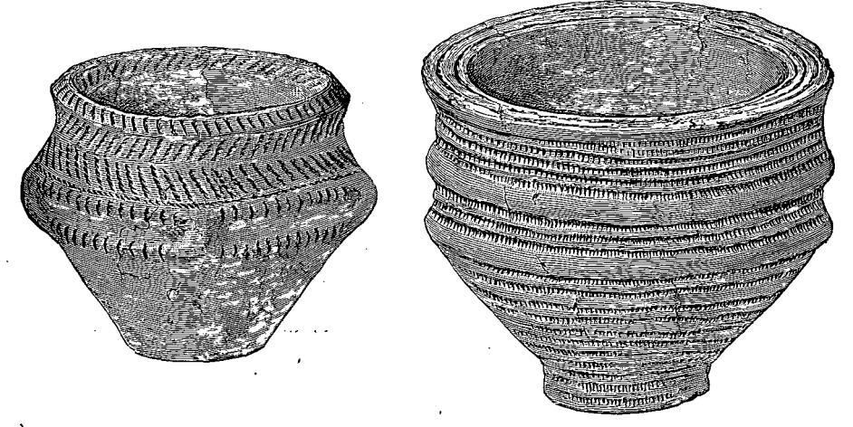
Figs. 3, 4. Urns found in the Cist at Battle Law, Naughton, Fife. (4.)

mixed up more or less with the earth which filled the cavity of the cist. No unburnt remains were detected, although carefully looked for when clearing out the interior. Incinerated bones were found in greatest quantity close to the east end, and it seems probable that this was originally the point of deposit. No evidence of the presence of bronze was detected. After the removal of the urns, the whole contents of the cist were put through a fine riddle and carefully examined for relics, without any being thus discovered.