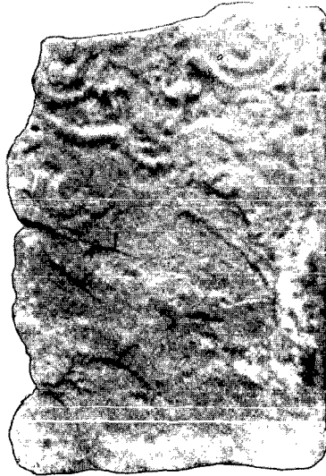
Fig. 3. Edderton Stone (No. 2.)

animal placed with its feet towards the side of the stone, the line of its back parallel with the side of the upper arm of the cross. Over the upper arm of the cross is a beast, apparently of the same character, and placed in the same way with its feet towards the upper margin of the stone and its back parallel with the upper line of the cross. These animal figures are so crude and so much decayed, that it is impossible