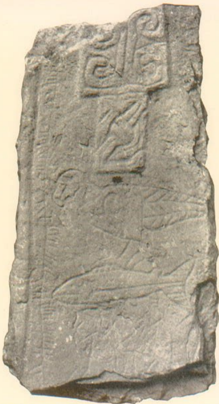
Fig. 1. Sculptured Slab with Ogham Inscription from Latheron, Caithness. (1.)