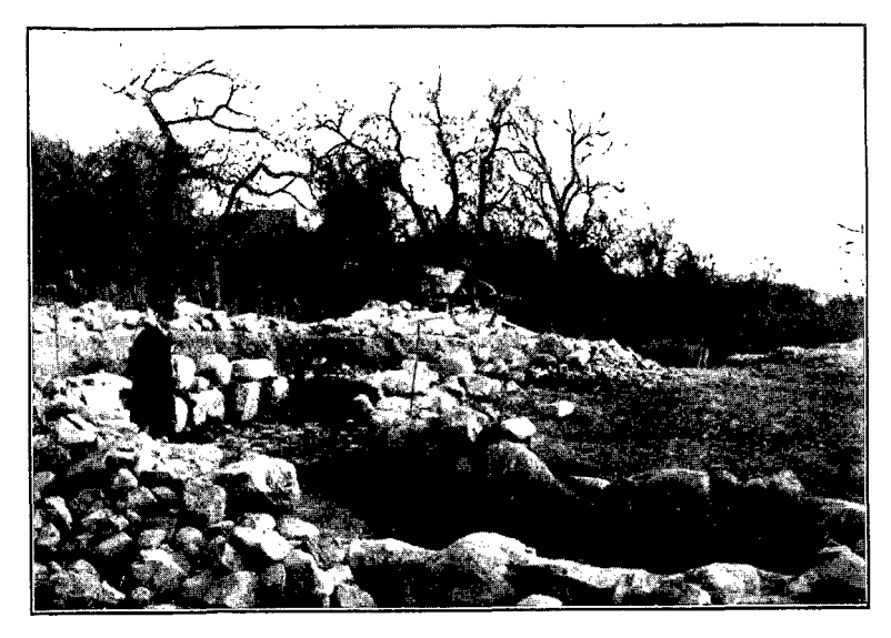
Fig. 2. View of Earth-house from lower end.

wall of the earth-house, but the right-hand side of the entrance was prolonged inwards only 6 feet 4 inches, and then formed a projection, behind which was a recess 3 feet in depth and about 4 feet in width. The entrance passage, this recess, and a portion of the structure extending backward 8 feet from the inner end of the passage were rudely paved with stones. From this point the earth-house exemplified the usual characteristics of its class by sloping downwards and curving rapidly to