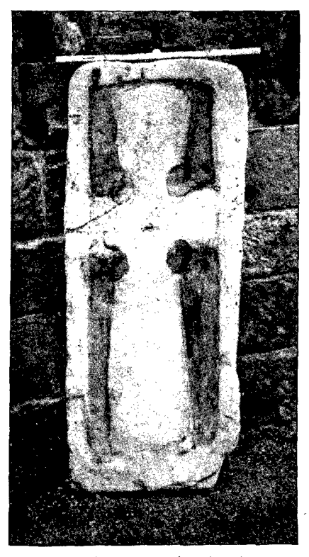
Fig. 1. Celtic Cross-Slab found at the Church of St Mary on the Rock, St Andrews.

on the obverse and reverse (fig. 2), has been quite plain, save for the narrow border lines, but on both there is a rich panel on either side of the shaft. Neither on the obverse nor reverse are the panels of the