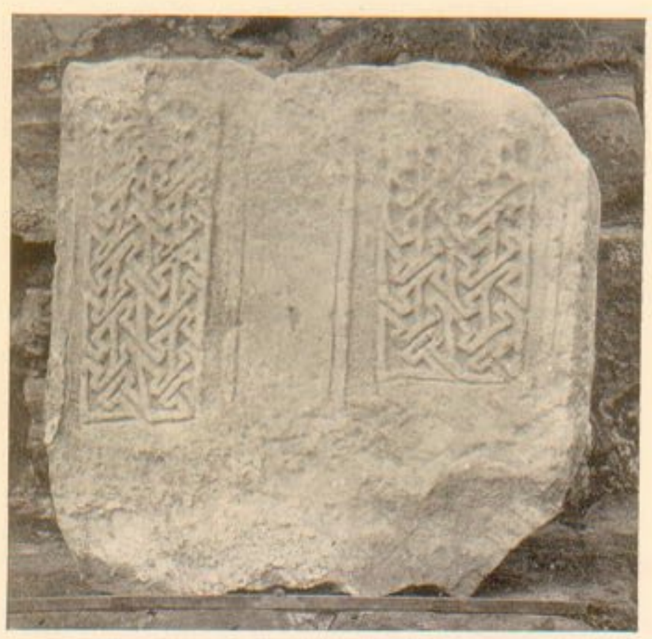
Fig. 2. Obverse and Reverse of Fragment of Celtic Cross-Slab found in the Abbey Wall, St Andrews. VOL. XLVII.