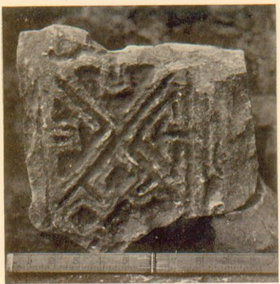
Fig. 3. Edge and Obverse of a Fragment of a Celtic Sculptured Slab found in the Enclosing Wall of the East Infant School, St Andrews.