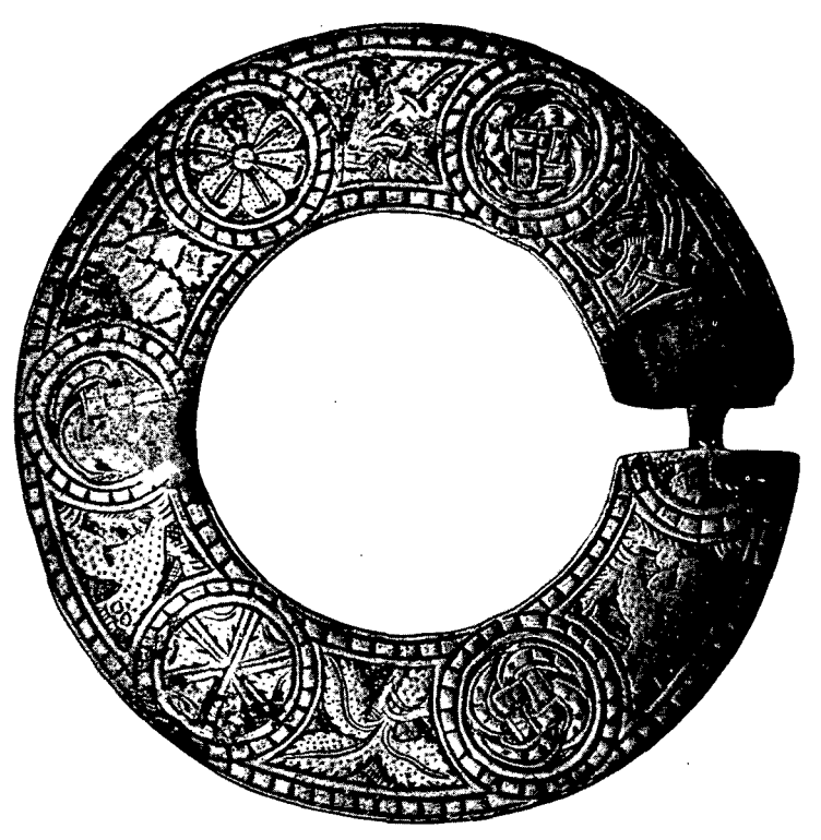
Fig. 2. Highland Brooch of Brass (<sup>2</sup>/<sub>3</sub>).

A collection of Flint Objects, an Urn with a narrow groove immedi-