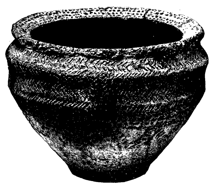
Fig. 4. Urn found at Flawcraig (\frac{1}{2}) .

Food-vessel Urn, 4.7 inches in height, with a groove round the shoulder interrupted by five imperforated flat stops, found with an incinerated interment in a short cist at Flawcraig farm, Kinnaird, Perthshire.