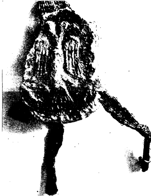
Fig. 1. Seal of the Burgh of Lanark, 1357.

This seal (fig. 1) is still preserved in the Record Office, Chancery Lane, London. It has been attached, along with other Scottish burgh seals, to the procuratory for the ransom of David II. in 1357. The wax has suffered a good deal from the corroding influence of time during its well-nigh six hundred years of existence. The border is much worn away; the legend has disappeared; but the two fishes and the double-headed eagle are still recognisable.