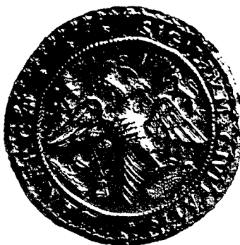
Fig. 3. Seal of the Burgh of Lanark of eighteenth-century date.

On the 9th July 1814 the Town Council authorised a new seal to be engraven "to be used in room of the present which is too small." The seal here referred to as being "too small" measures about 1\frac{1}{4} inch across; the new one has a diameter of 2 inches. This is seal No. 6. It is thus described by Mr Laing in his Descriptive Catalogue of Ancient Scottish Seals : "An eagle displayed with two heads placed heraldically on a shield: the two lions in chief being passant counter passant; and two fishes (salmon?) in the lower part; the bell pendent to the dexter claw by a string of the last. The legend is 'Sigillum Civitatis Lanarcae.'"