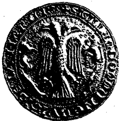
Fig. 2. Seal of the Burgh of Lanark of early fifteenth-century date.

Seal No. 2 (fig. 2) (matrix preserved) is thus described in Laing's Supplementary Catalogue of Scottish Seals (published 1850-66): "An eagle displayed with two heads, not on a shield, between two lions rampant in the upper part; and two fishes (salmon?) in the lower part; the background ornamented with annulets. The legend round the border is 'Sigillum Commune Burgi de Lanarck.'"