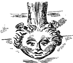
Fig. 2. Medusa-Head on Roman Vessel of Bronze.

Street, a boat-shaped vessel of bronze of classical workmanship (fig. 1), with an extreme length of 8\frac{1}{2} inches and a maximum breadth of 5\frac{3}{8} inches. The vessel, which has evidently been intended for the serving of some liquid, is slightly constricted towards the centre in such a way that the upper edges of the hindward parts tend to become overhanging and thus prevent spilling. The handle, which is admirably adapted for its purpose, is designed on lines which suggest the upper portion of a rudder. At the point of contact with the exterior, the "stern" is decorated with a Medusa-head (fig. 2), while the grip, which runs lengthwise above the middle of the vessel for about one-