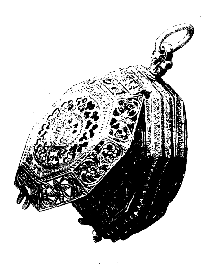
Fig. 1. General view of Watch.

The general character of the case is undoubtedly South German, but it is not more German in character than the case of the watch signed "Richard Crayle Londini fecit." There is, however, one notable difference between the two. In the English watch there