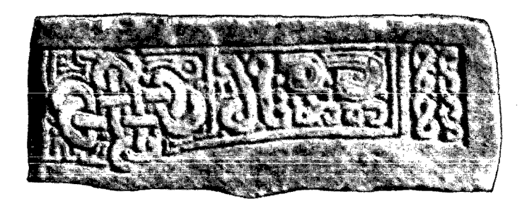
Fig. 2. Cross-slab from Millport.

The stone which I wish to describe and illustrate herewith was also discovered adjoining the manse garden (fig. 2). Taken in conjunction with the stones at the Cathedral, this stone seems to prove that there was an early Celtic settlement on this site, although nothing definite of its history seems to be known. A further proof is that the manse