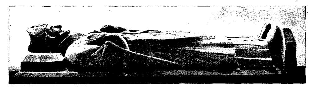
Fig. 3. Effigy in Luss Kirk.

The mitre is an example of the bishop's distinctive headgear at what is probably the most pleasing stage in its development, namely, about the beginning of the fourteenth century, or about a hundred years before the vertical sides of the cap had given place generally to