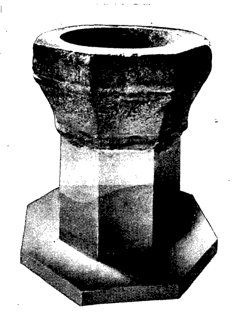
Fig. 5. Font in Buchanan Kirk.

The basin, mounted on a modern column and base, is a fine octagonal font, which, upon close inspection, reveals details worthy of comment despite the weathering long suffered by the soft light brownish-grey sandstone whereof the vessel is hewn.