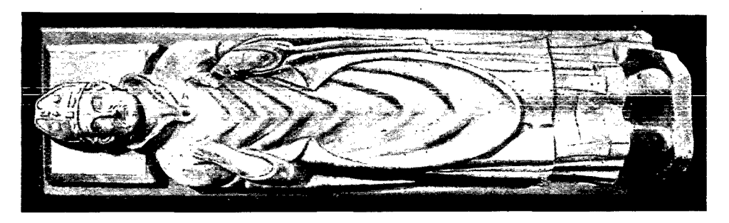
Fig. 2. Effigy in Luss Kirk.

The body of the effigy lies on a slab 3\frac{1}{2} inches thick, bevelled for 1\frac{1}{2} inch along its full length on both sides, and the head reposes on a plain rectangular pillow 18\frac{1}{2} inches by 12\frac{5}{8} inches by 3\frac{1}{2} inches, also chamfered. The feet rest upon a block 18\frac{1}{2} inches wide and 10\frac{1}{2} inches high, the corners neatly angled off for 5 inches. These parts, apparently additional to the sculpturing of the prelate, are, nevertheless, integral with the whole monument which is carved out of a single block of stone. The plain finish of the pillow and footrest is not a common feature of episcopal effigies; it seems to be more usual to find the