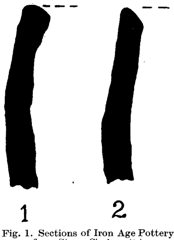
Fig. 1. Sections of Iron Age Pottery from Stone Circle. (†.)

The thirteen potsherds from Foularton represent as many vessels. Amongst them are two rims (fig. 1, (1, 2)). The ware is very coarse: the paste seems to be of the usual quality associated with this type of pottery; but it often contains large pebbles, and the potter has not