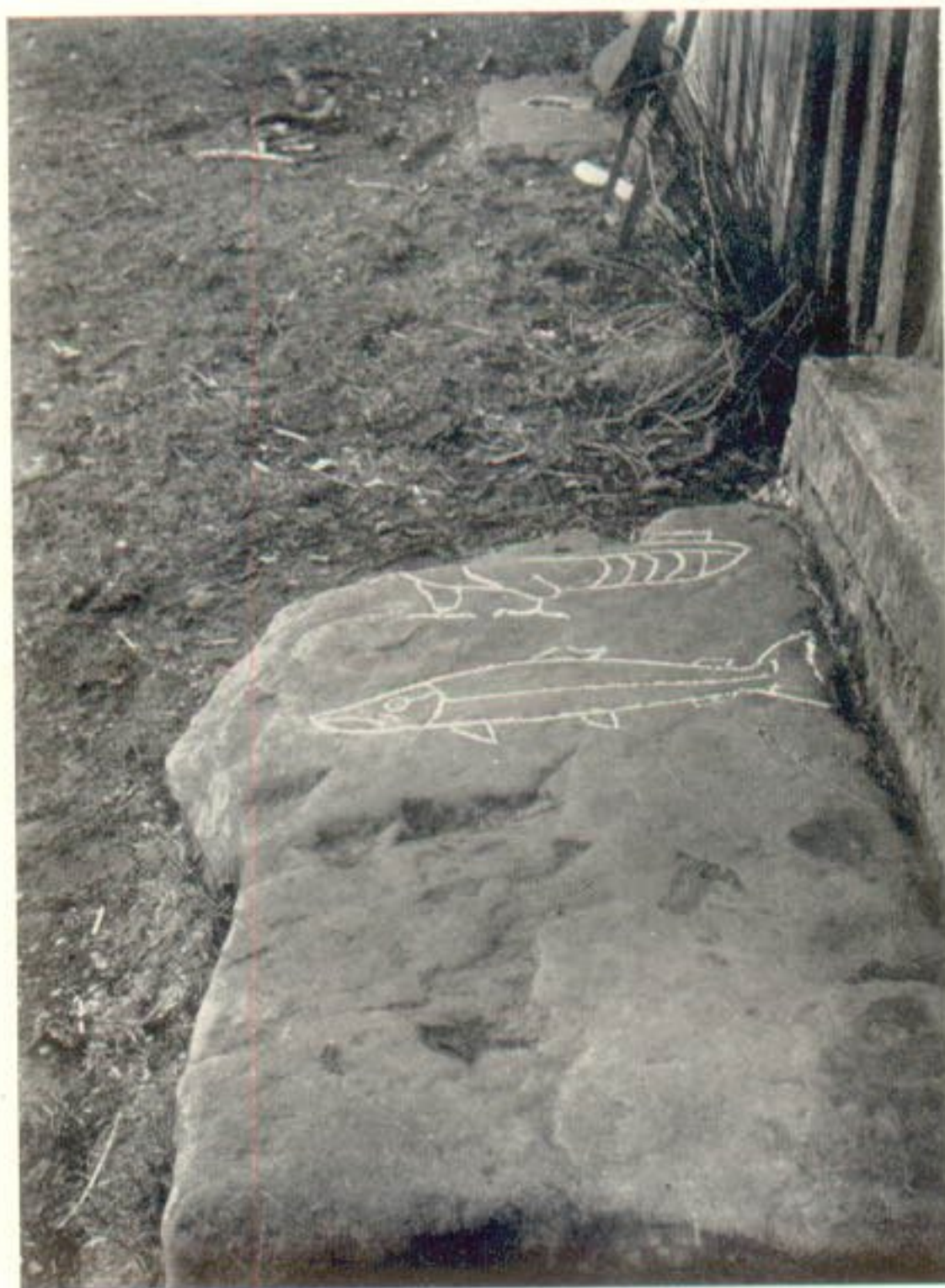
Symbol stone at Flowerdale House, Gairloch.