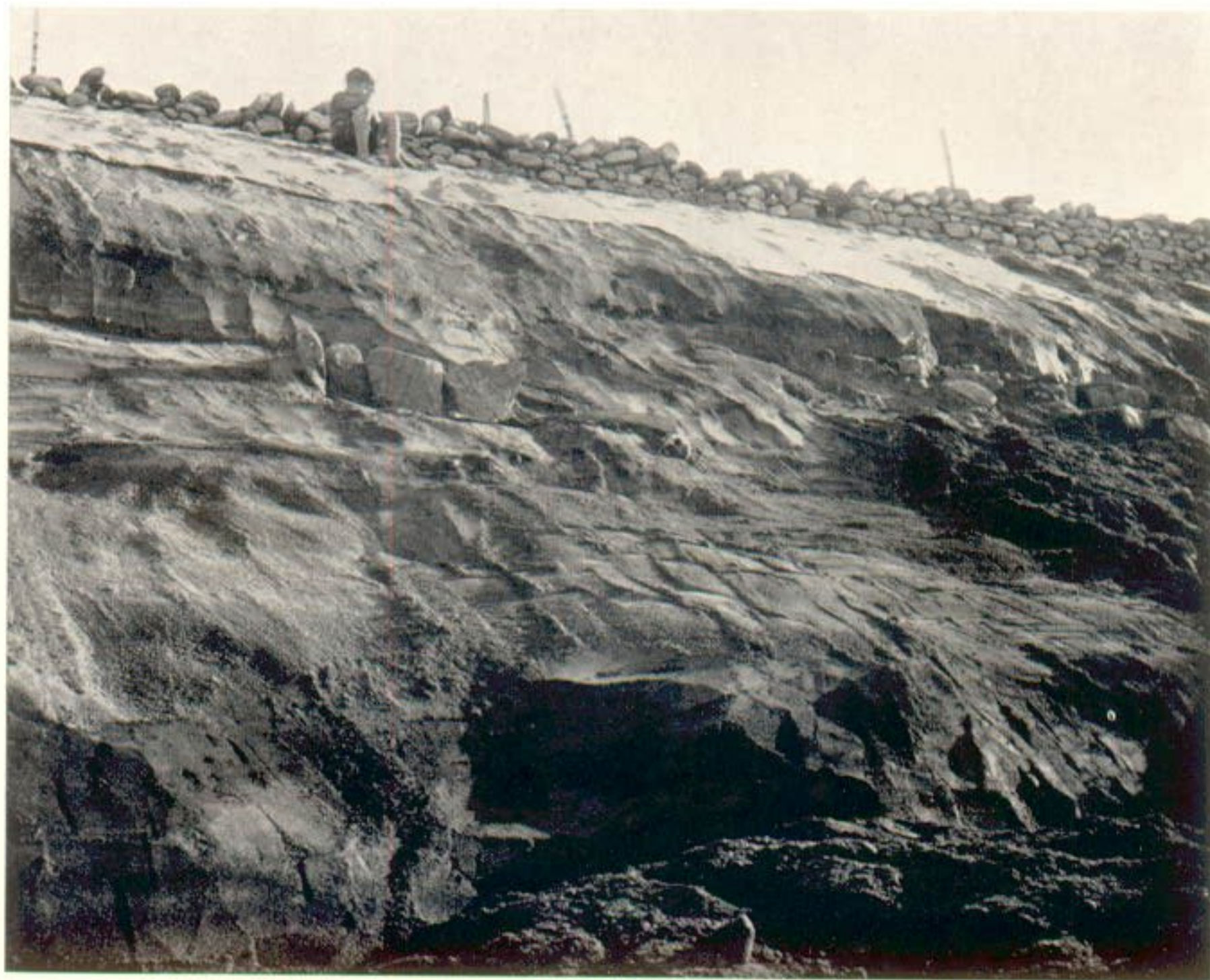
1. Sandbank at Galson with bands of midden; on the right, wall "Y"; on the left, long cist burial V.