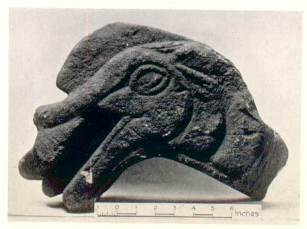
1. Dragon Head of sandstone, Kirkintilloch. (Note 6.)