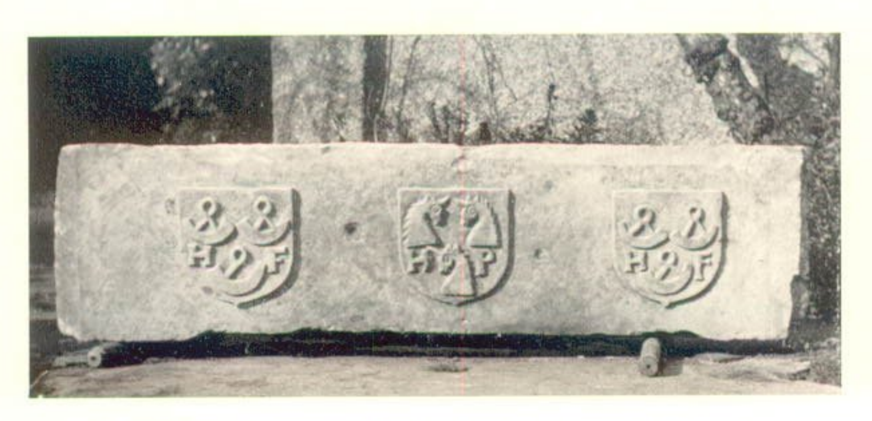
3. Corstorphine marriage lintel. (Note 10.) Length 5 ft. 3 ins.