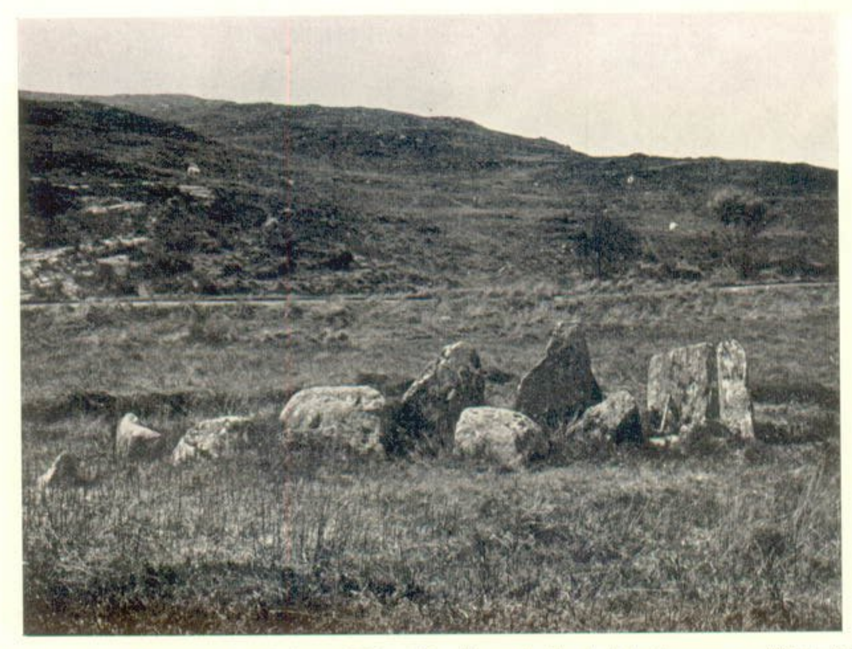
1. Badnabay corridor-tomb from NE. Headstone indicated by hammer. (Note 9.)