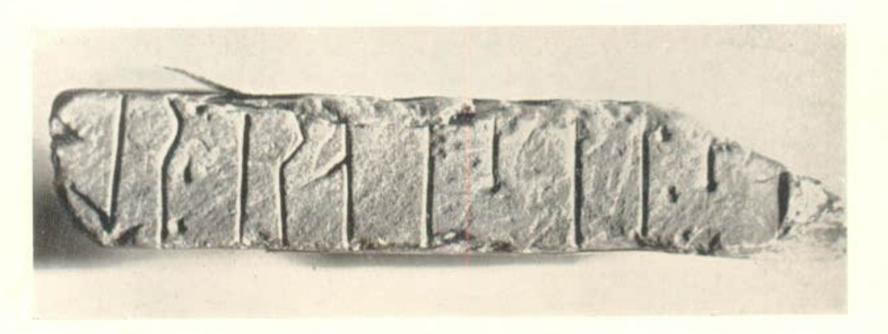
2. Runic stone, Papil, Burra Isle, Shetland. (Note 8.) Length 7½ ins.