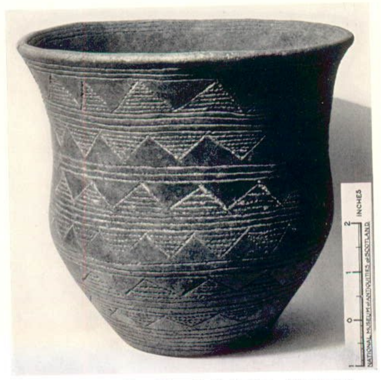
2. B 1 Beaker from Fingask, Perthshire. (Notanda.)