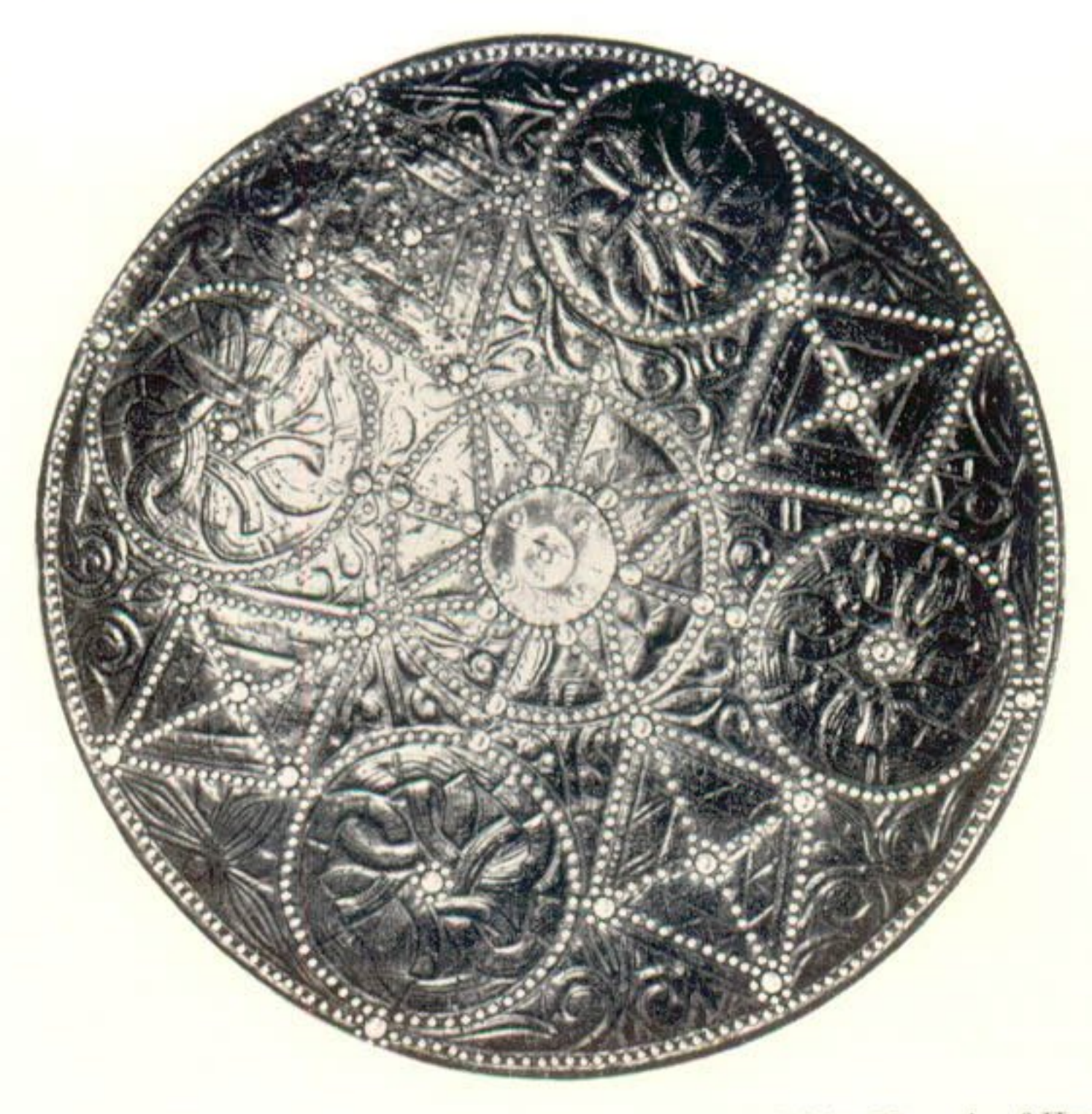
Tooled leather Targe with silver studs, believed carried by Marquis of Huntly at Sheriffmuir, 1715. (Note 4.) Actual diam. 21 ins.