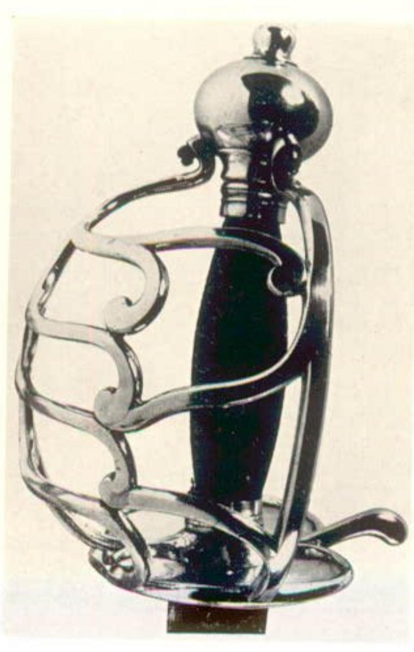
3. Silver-hilted broadsword from Milne-Davidson collection. (Note 4.) Actual length 6\frac{3}{4} ins.