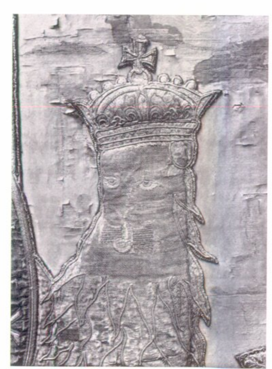
Details from the Hay hanging

Henshall and Maxwell: Two Royal Coats of Arms.