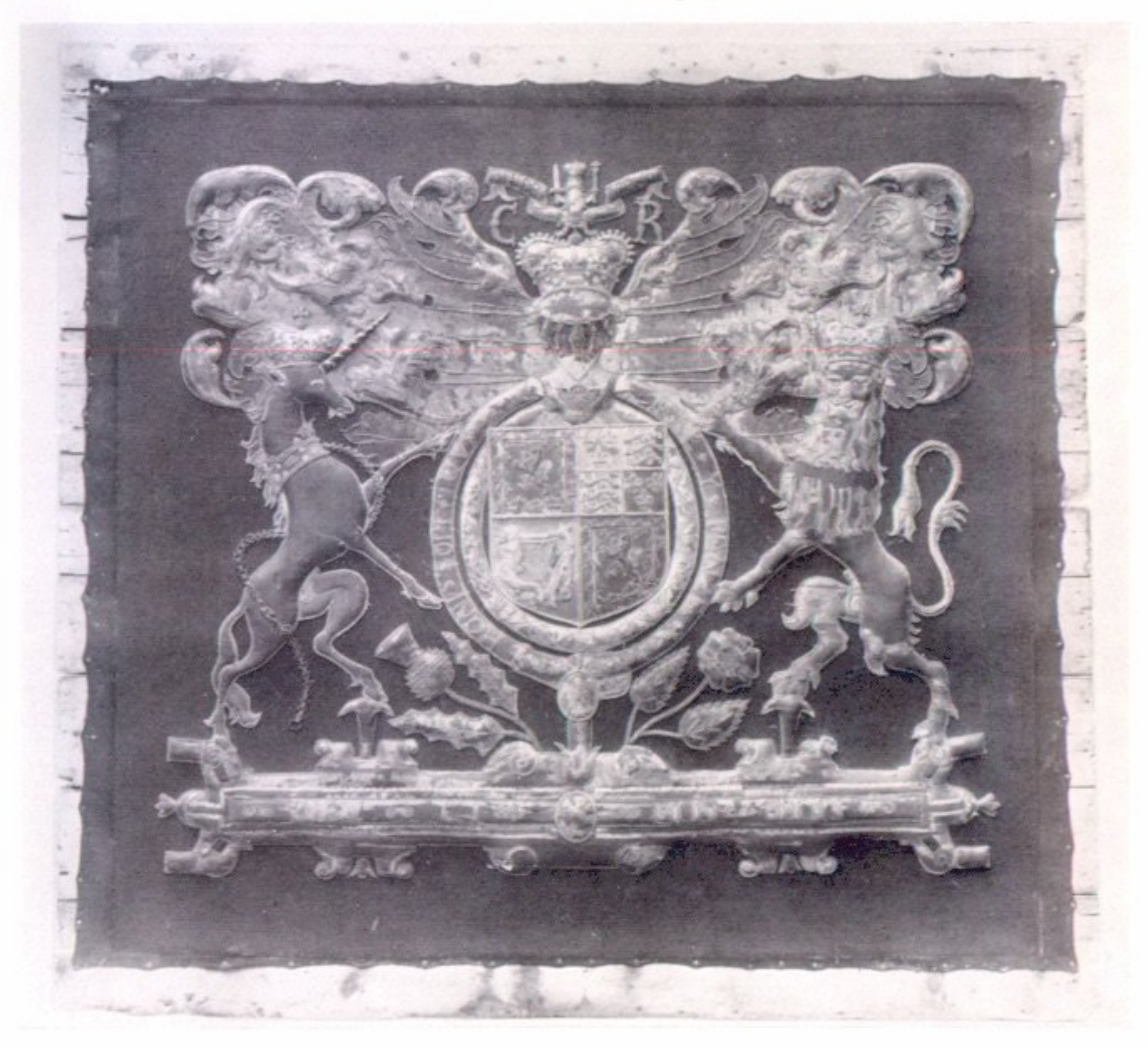
The hanging from the Council Chambers, Edinburgh - the arms of Charles II

Henshall and Maxwell: Two Royal Coats of Arms.