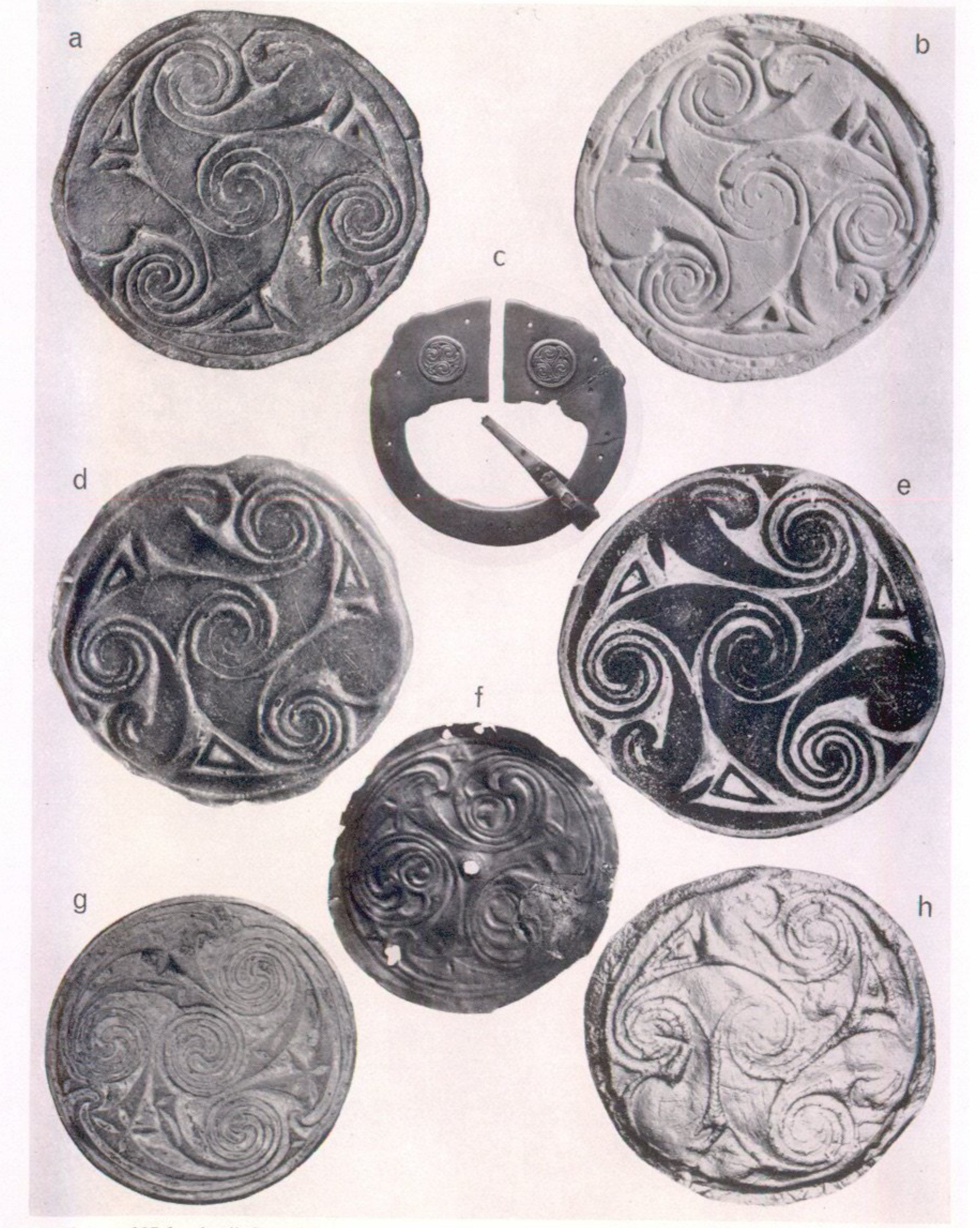
PLATE 24 | PSAS 105