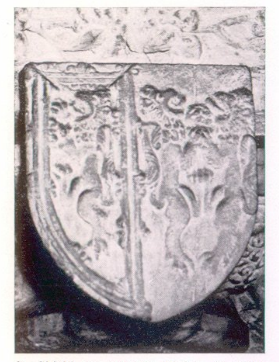
b Shield on 'King's Pillar'. St Giles Church, Edinburgh