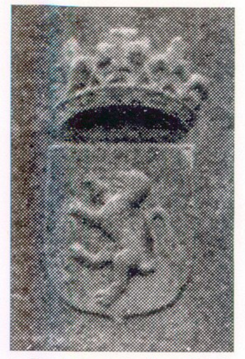
a Royal arms on S pillar on W side of Bridge of Dee, Aberdeen