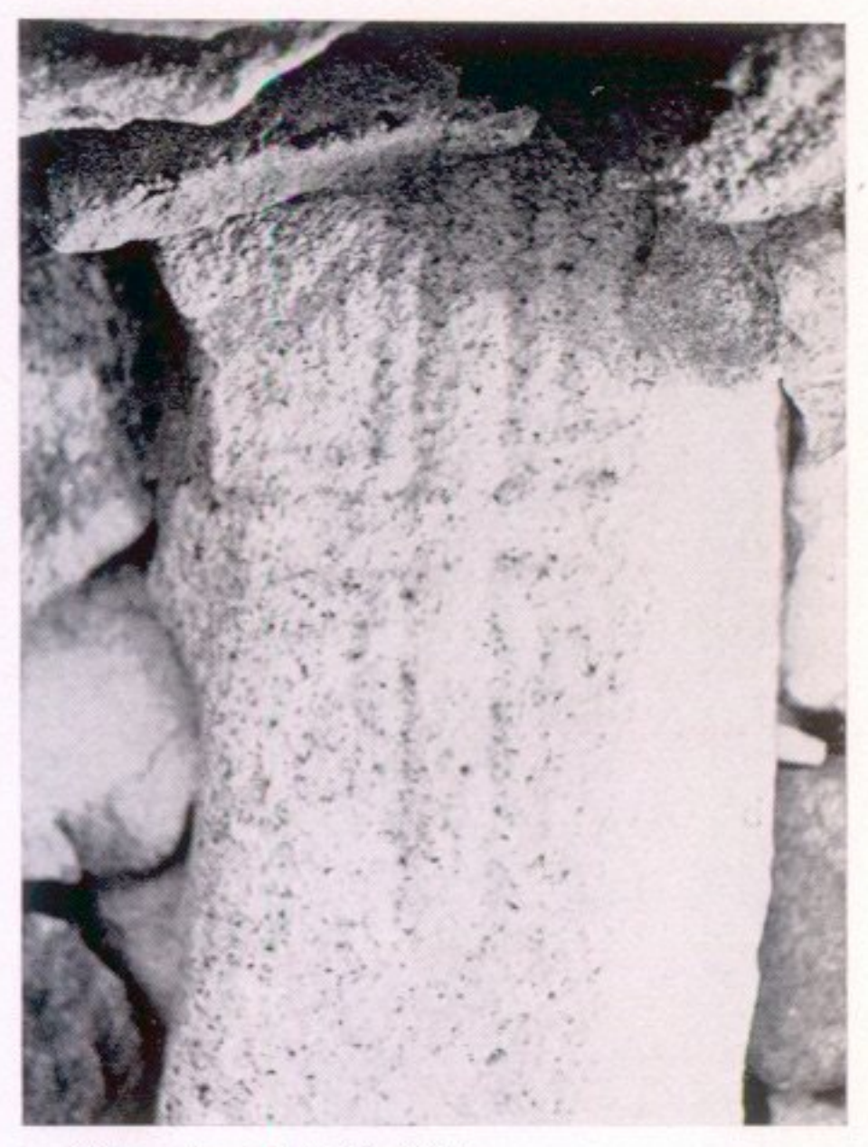
a Stone in cleit 74, Hirt