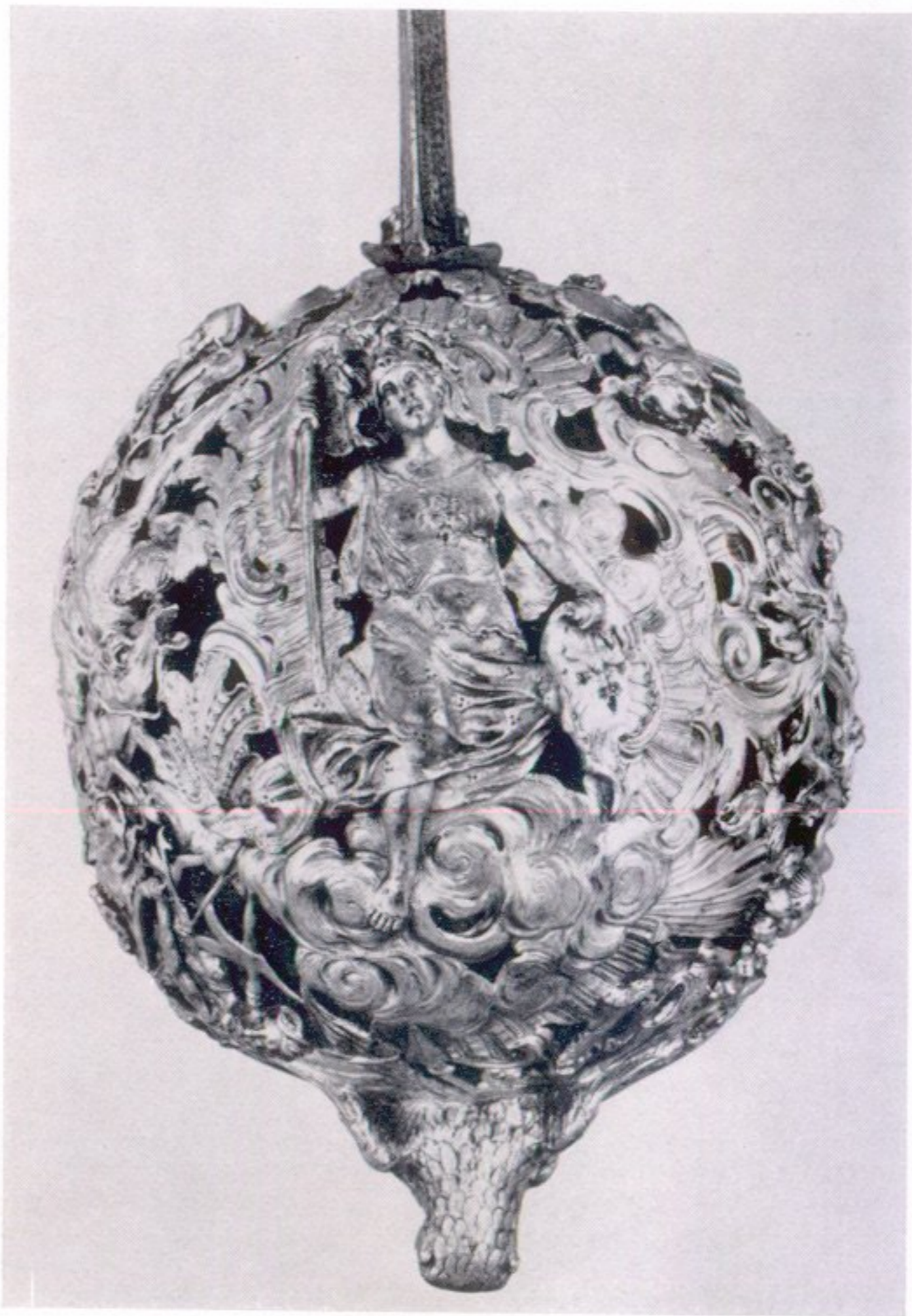
Prince Charles Edward's sword | NORMAN