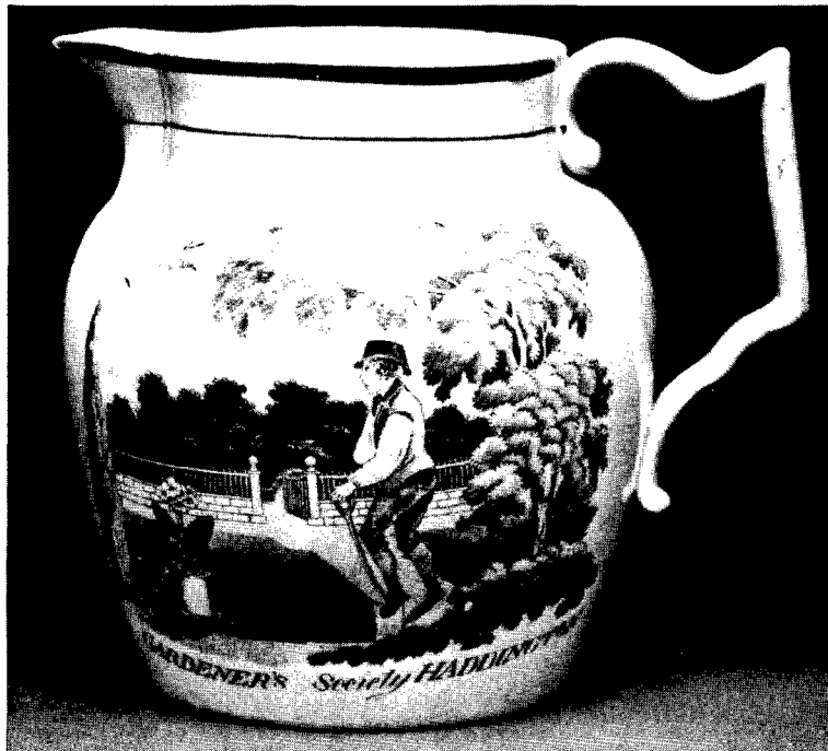
ILLUS 2 One of a pair of earthenware jugs of the ‘Gardner’s Society of Haddington’ (Donation)