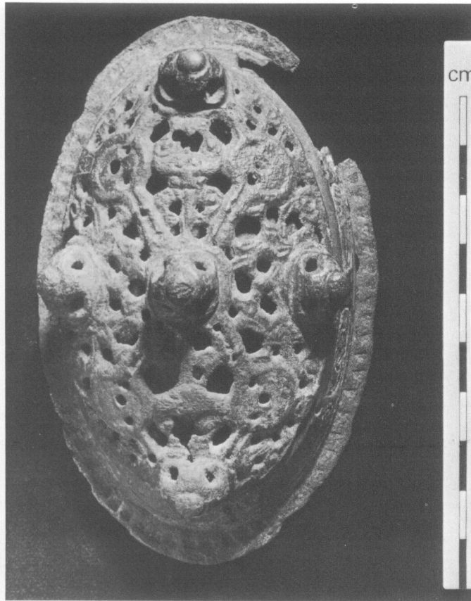
ILLUS 4 Viking-Age tortoise brooch from Thurso (Purchase: Treasure Trove)

Eleven panels of green silk, embroidered with flowers, insects and 'SIR COLINE CAMPBELL/DAME IELIANE CAMPBELL OF GK/1632'.