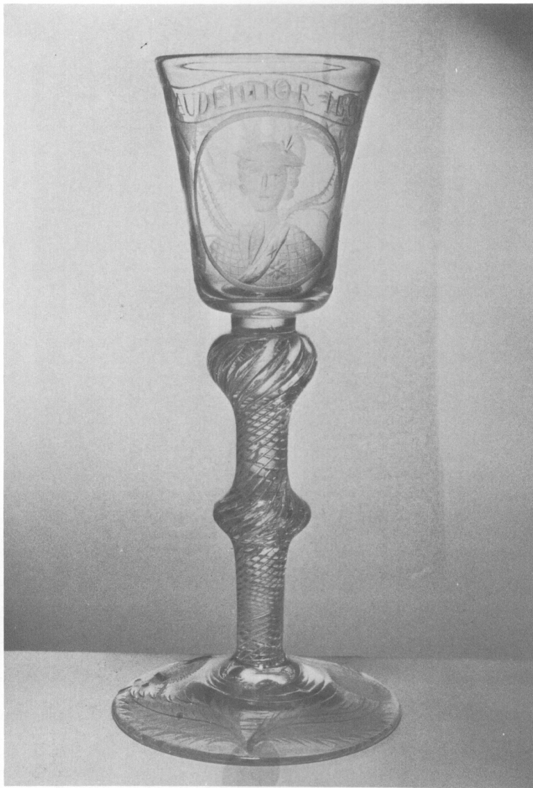
ILLUS 6 Jacobite wine glass, engraved with a portrait of Prince Charles Edward Stuart (Purchase)

Jacobite wine glass, engraved with portrait of Prince Charles Edward Stuart and the motto 'AUDENTIOR IBO' (illus 6).