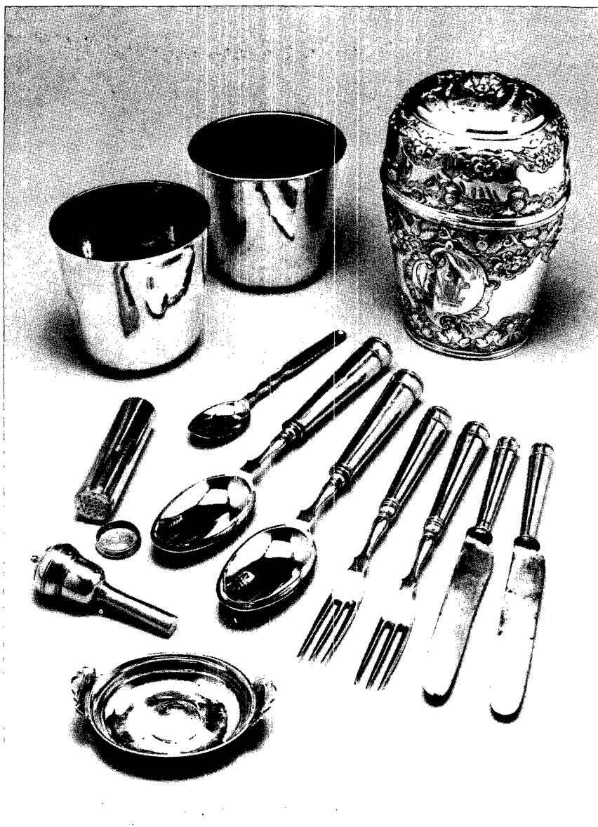
ILLUS 7 Silver travelling Canteen of Prince Charles Edward Stuart; the outer case and beakers by Ebenezer Oliphant, Edinburgh, 1740-1 (Purchase)