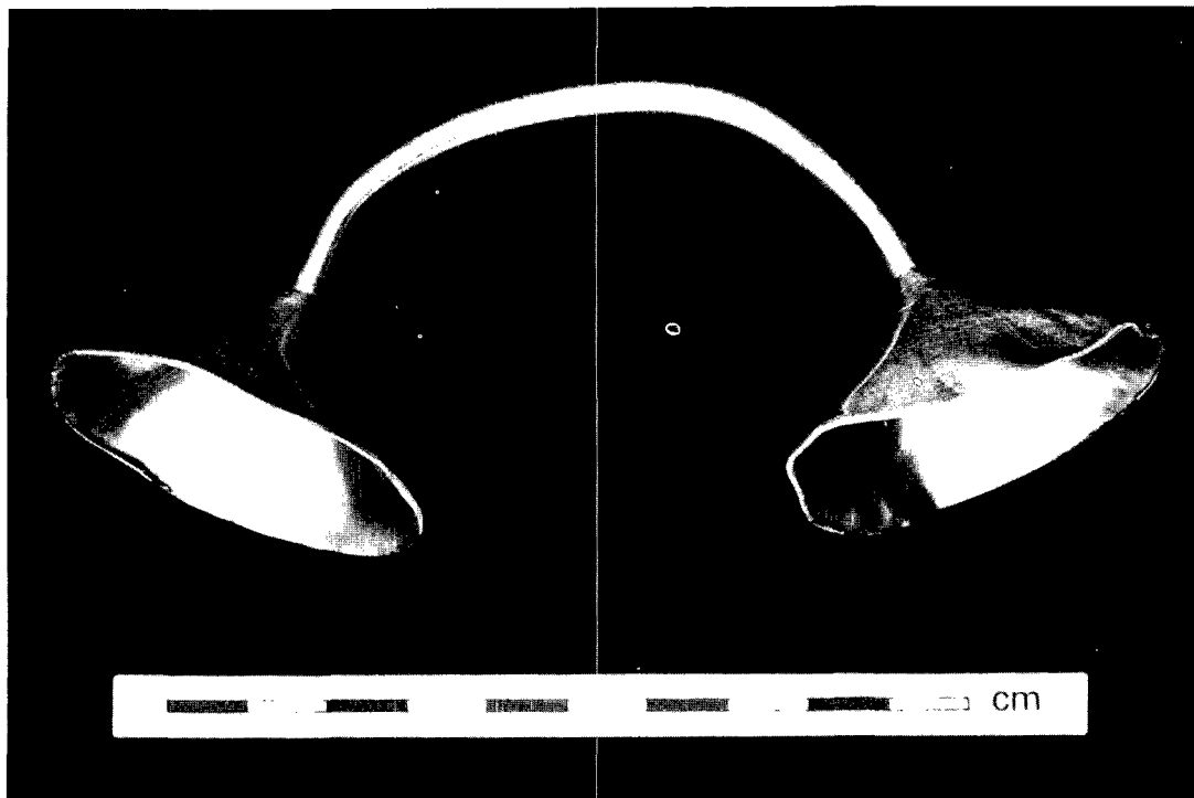
ILLUS 3 Bronze-Age gold dress fastener from the Isle of Skye (Purchase: Treasure Trove)