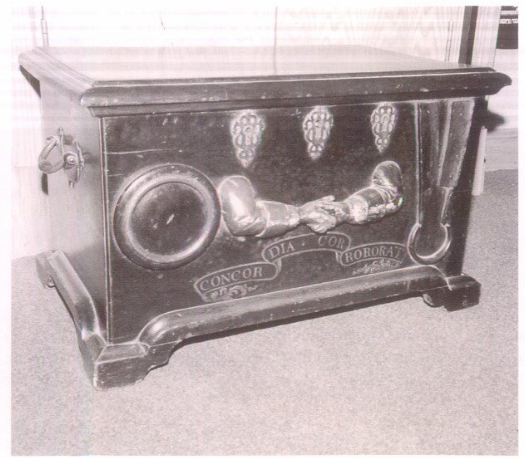
ILLUS 2 Box, Incorporation of Bonnetmakers of Glasgow, first half of 18th century. ?Mahogany with painted decoration; H: 462 mm, W: 746 mm, D: 467 mm. Inscription: CONCORDIA CORROBORAT [Unity Strengthens]. (Incorporation of Bonnetmakers & Dyers of Glasgow)