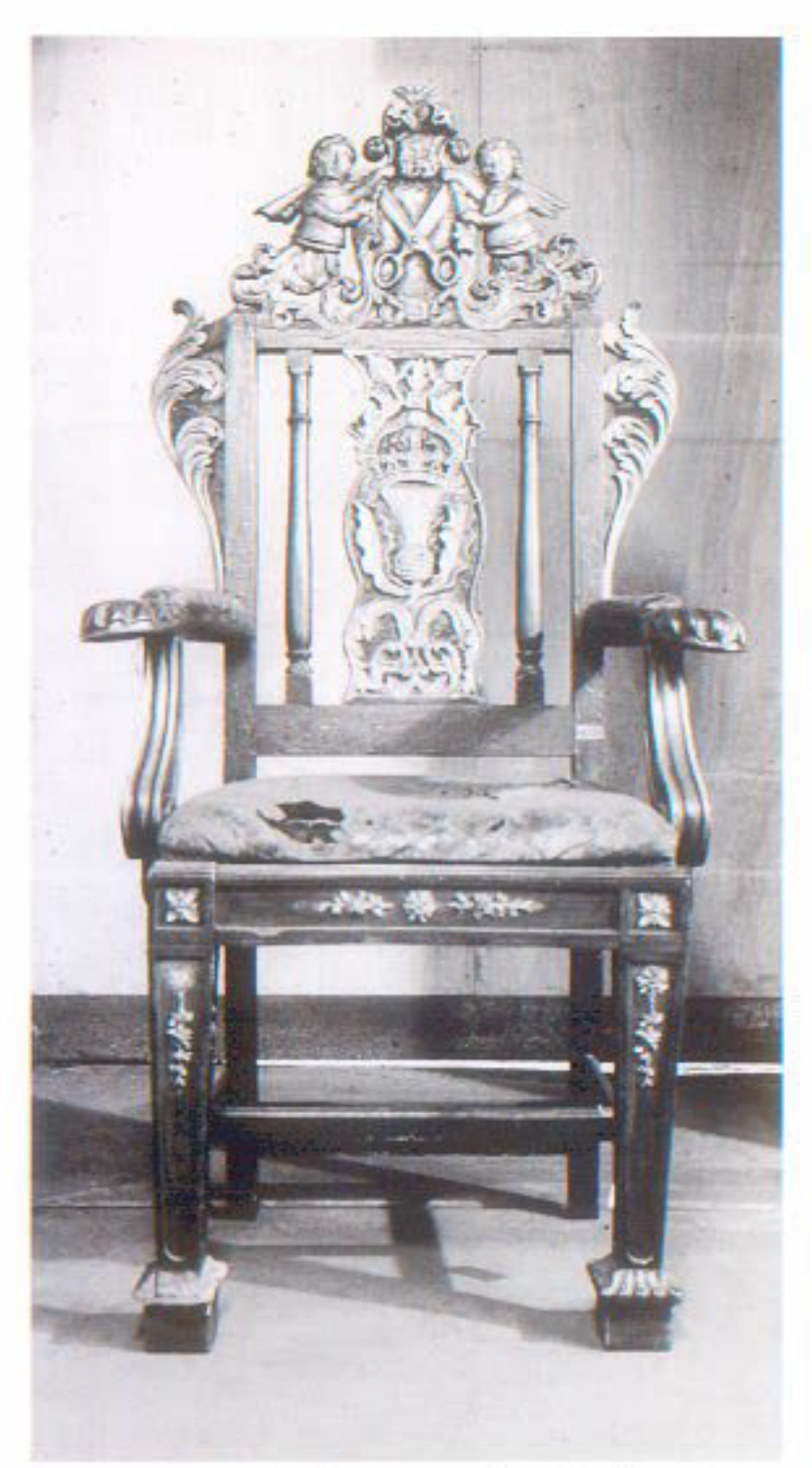
ILLUS 10 Deacon's chair, Incorporation of Tailors of Easter Portsburgh, 18th century with extensive 19th-century repairs. Pine, mahogany & gesso with traces of painted decoration, H: 1620 mm, W: 800 mm, D: 495 mm. (Edinburgh City Museums & Art Galleries)