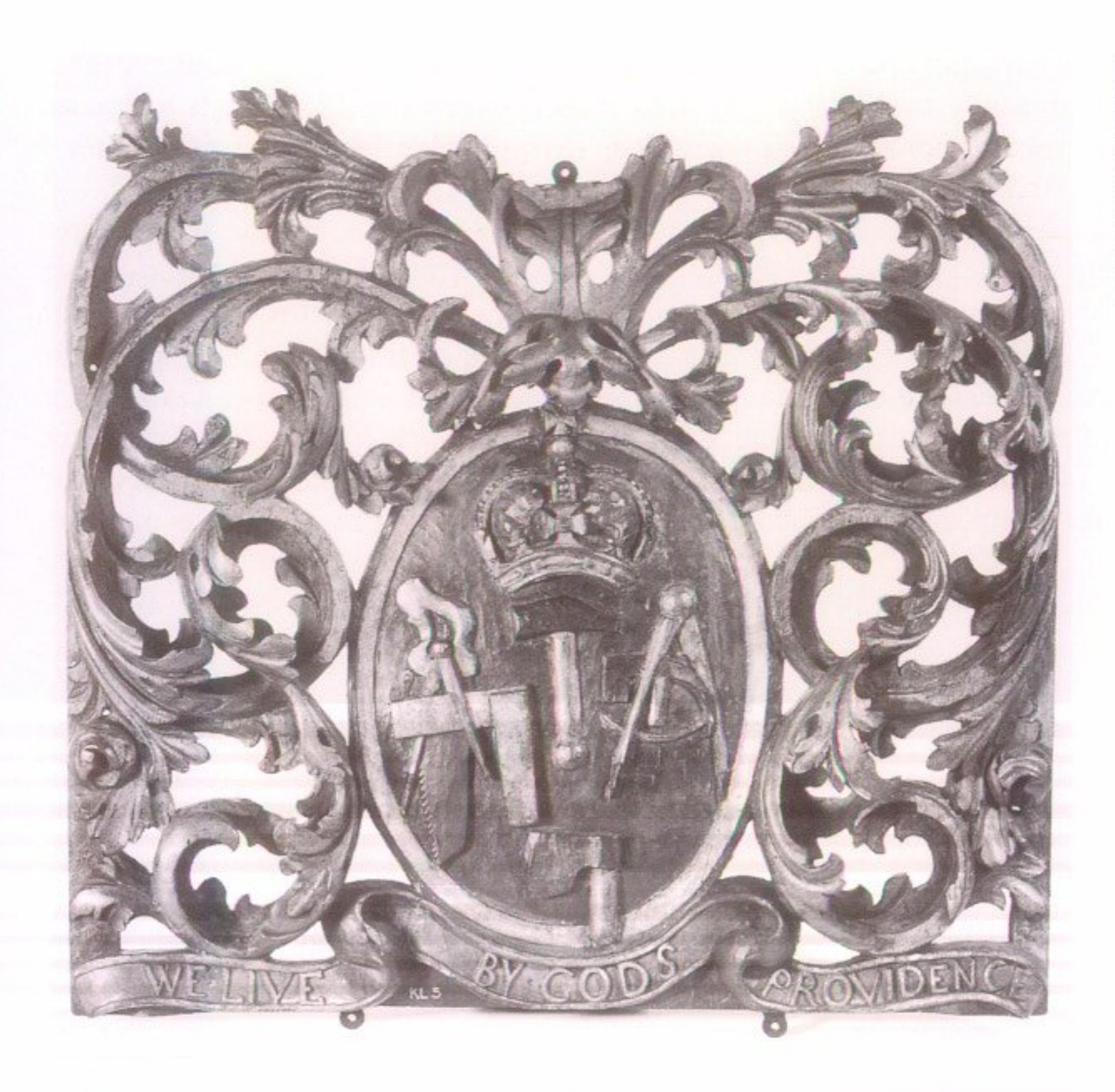
ILLUS 1 Incorporation of Hammermen's church loft panel, Dalkeith, second half of 18th century. 'Oak; H: 770 mm, W: 830 mm. (Trustees of the National Museums of Scotland (Accession KL5))