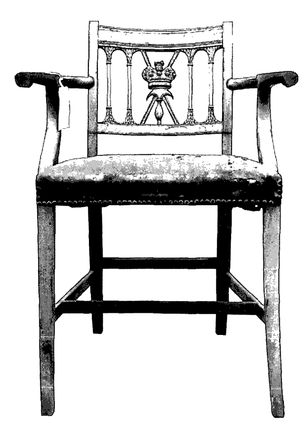
ILLUS 5 Deacon's chair, Incorporation of Shoemakers of Perth late 18th or early 19th century. Elm or sycamore; H: 1090 mm, W: 640 mm, D: 500 mm. (Perth Museum & Art Gallery)