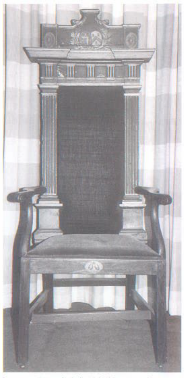
ILLUS 11 Deacon's chair, United Incorporation of Wrights & Masons of Edinburgh, 18th century. Beech with painted decoration; H: 1675 mm, W: 635 mm, D: 500 mm. (Incorporated Trades of Edinburgh)

immediate comparison is suggested with certain English masonic chairs (Hewitt 1967, 137). It is tempting to think that the same chair was used by Lodge of Edinburgh (Mary's Chapel) No 1, which also met there. Yet the painted decoration, which includes the arms of both wrights and masons, suggests that the chair was used primarily for ordinary Incorporation business.