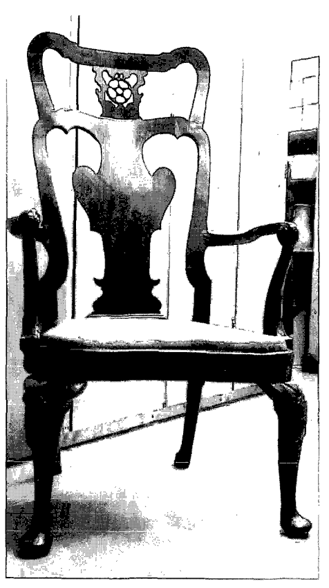
ILLUS 6 Deacon's chair, Incorporation of Wrights of Perth, 1748. Beech & mahogany; H: 1295, W: 675 mm, D: 545 mm. (Perth Museum & Art Gallery)