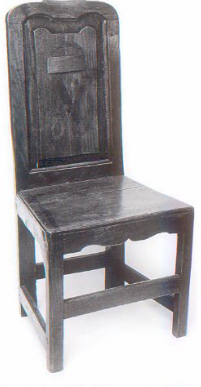
ILLUS 3 Deacon Convener's chair, Incorporated Trades of Old Aberdeen, c 1760. One of a pair. Oak; H: 1040 mm, W: 580 mm, D: 480 mm. (City of Aberdeen Art Gallery & Museums Collections)