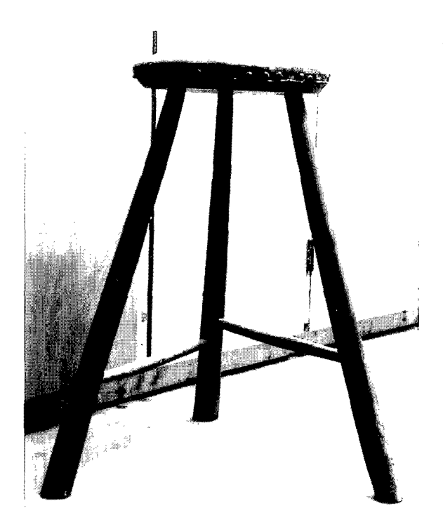
ILLUS 7 Stool, Incorporation of Wrights, Perth, 18th century. Elm; H: 690 mm, W: 560 mm, D: 560 mm. (Perth Museum and Art Gallery)

scrollwork was most probably added to the top.<sup>3</sup> Other parts of the bill can be explained as follows. The Scots ell was 37 in (945 mm) in length; six ells, therefore, represent 5.67 m. Dippor web was probably linen webbing to go under the seat and tyking a tightly woven cotton or linen fabric. Takets are simply tacks and the pasband probably a flax or jute material used underneath the outer layer of leather. The 'Russian' leather used at the front was a plain-surfaced, high-quality leather. Workmanship on the frame, including the carving, would be included in the basic item of £24.