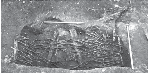
ILLUS 8 King Edward Street, Perth. A pit capped with a wattle lid

were for domestic refuse. Similarly, at 80–6 High Street, Perth, the establishment of a large number of pits on and near the frontage, filled with both domestic and craftworking waste, appeared to coincide with the absence of any associated structures domestic or industrial. At 42 St Paul's Street, Aberdeen, domestic settlement was replaced in the early 13th century by rubbish pits, cesspits and midden spreads; the number of rubbish and cesspits, in addition to extensive spreads of midden, then doubled after the plot boundaries had been reorganized c 1300.