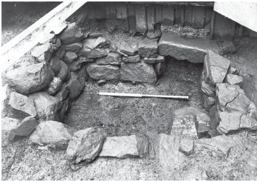
ILLUS 10 Mill Street, Perth. A large cesspit

buildings, but internal latrine pits have been found at Kirk Close, Perth (complete with graffiti-covered toilet seat), and at High Street, Edinburgh. They can be stone-, timber- or clay-lined, which suggests they were cleaned out regularly, and can be served by complex flushing systems (illus 10). As with many other types of pit, they were often dug for one purpose and re-used for another. At High Street, Elgin, four plots complete with wattle fences were uncovered together with 30 well preserved cesspits. Two possible cesspits were found at Loudon Hall, Ayr: one was clay-lined with a surrounding fence for privacy, while the other appears to have been stone-lined. At 42 St Paul Street, Aberdeen, there was a stone-kerbed cesspit and another with stones in the base as soakaway. At Castle Street, Inverness, a timber-lined cesspit found close to the frontage was also used as a rubbish-pit. Cesspits were also found within yard areas on the frontage of 45–7 Gallowgate, Aberdeen. At Canal Street I, Perth, a stone-lined cesspit in the backlands was flushed by a drain with a sluice and served a late medieval stone building which lay across the former plot boundary. Similarly, in the backlands of North Street, St Andrews, a cesspit was fed by a stone drain. A group of pits found at Scott Street, Perth, appears to have been part of a complex sanitation system dated to the 14th or 15th century.