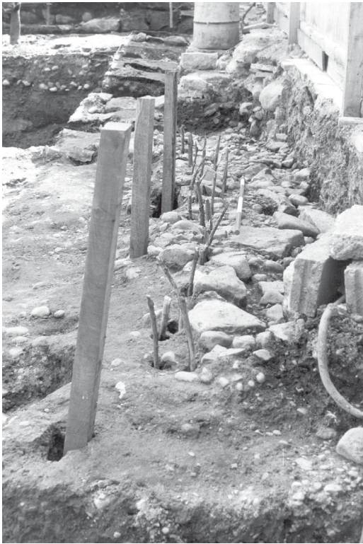
ILLUS 3 Castle Street, Inverness. A timber fence marks the edge of the medieval street

holes survive, but in some towns, where the soil conditions are favourable, the wattle hurdles, often hazel, also survive, as at several sites in Perth and Aberdeen. On street frontages, there is the added problem that stretches of wattle fence or lines of post-holes could also represent buildings as, in order to maximize the limited available space, building lines often doubled as property boundaries. At Castle Street, Inverness, a wattle fence marked the front of the plot but there was no actual building on the plot (illus 3).