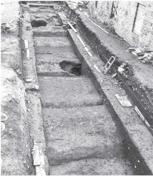
ILLUS 2 Canal Street II, Perth. Shallow gullies mark out the six medieval properties

holding of land in a burgh. The Scots acre (c 5142sq m) is thought to have been larger than the English acre (c 4047sq m) and to have defined a stretch of arable land 258m (a furlong) in length by about 19m in width (Barrow 1981, 173). If this rural unit of landholding was being used in burghs and was simply being divided into four equal strips, a standard Scottish burgage plot should, therefore, measure 4.8m in width by 258m in length. Using an English acre (140 square poles), a rood would equate to each plot measuring 5.2m by 201.2m; that is one pole wide by 40 poles long.