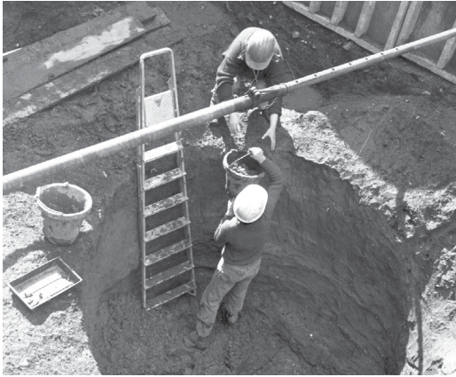
ILLUS 7 Canal Street I. A large quarry/rubbish pit

the sheer number of pits found on excavated sites, filled with domestic and craftworking debris, indicates that much was merely buried on the burgh plot. Whether the Black Death in 1349 led to an increased awareness of the need for hygiene, resulting in the formal removal and dumping of rubbish outside the burgh for example, is not clear but has been suggested as one reason why late medieval levels are less well represented by artefacts and other inclusions at the Marks & Spencer site, Perth (Bogdan 1992).