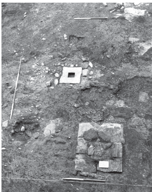
ILLUS 11 Meal Vennel, Perth. This area on the western edge of the medieval town was used for industry and craft-working. The base for an anvil and the base of a hearth (foreground) can be seen in this photograph

expertise and technology to carry out the full cycle from bloom to finished artefact.