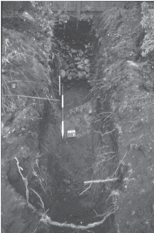
Illus 4 Back Dyke/Tanpit Lane, Kirkcudbright. The back dyke marking the end of the medieval plot is buried under garden soil

two sites in Kirkcudbright, Corby Slap and Tanpits Lane, stretches of rubble walls with an associated ditch were uncovered (illus 4). The differences in construction within the fabric of the walls would appear to be the result either of different techniques employed by respective plot owners or repair work over the years. At High Street, Edinburgh, the heid dykes backing onto Cowgate were later incorporated into the town's defences. Town walls and abbey precinct walls also provided a convenient opportunity to build lean-to structures. The King's Wall, Edinburgh, was built between 1425 and 1450, but by 1473 there was already a decree to pull down houses built against it.