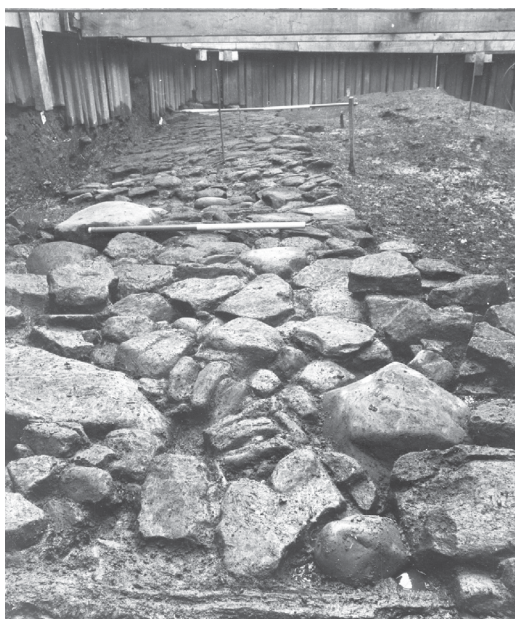
ILLUS 6 Mill Street, Perth. The cobbled road

Although gravel paths are most common, and were no doubt cheap and quick to construct, considerable effort went into some pathways, as at Marks & Spencer, Perth, where the boggy conditions required something more substantial. Here, a wattle path was laid down c 1150 which led through the backlands to various buildings, workshops, byres and storehouses. At 42 St Paul Street, Aberdeen four irregular plots were laid out c 1200. In the early 14th century these plots were reorganized to create more regular sized plots with a cobbled path between the two central plots. In the 15th-17th century, these were amalgamated and the path lost. Some paths were wide enough to function as roads or public routeways within the town. One path at Kirk Close, Perth, was wide enough for carts and led from High Street into the backlands, directly to a bakery. At Mill Street, Perth, a roadway, with associated drainage and a timber fence along one side, led from High Street into backlands and had been constructed over an earlier ditch and stone wall (illus 6). At Garden