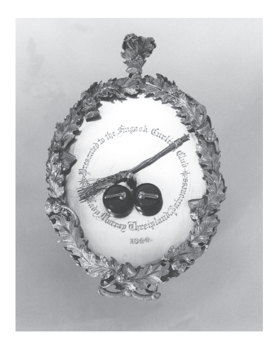
ILLUS 3 Fingask Curling Club, 1844

(duty mark); thistle (standard mark); castle (Edinburgh); 'M' (date letter for 1843–4). It is 12.5cm × 8cm.