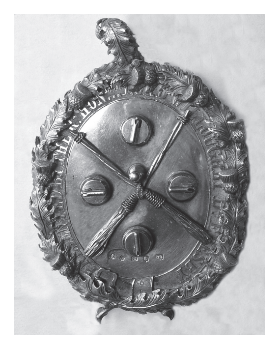
ILLUS 6 Drummond Castle Curling Club, 1853

The marks on the obverse are: queen's head (duty mark); thistle (standard mark); JS (maker's mark); castle (Edinburgh); 'W' (date letter for 1853–4). It is 12.5 \text{cm} \times 8 \text{cm} . The medal is in the author's collection.