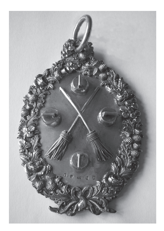
ILLUS 5 Alva Curling Club, 1853

The club was formed in 1848 and joined the RCCC the following year. The medal is in the author's collection.