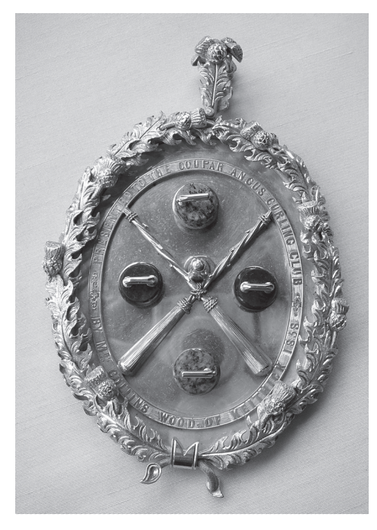
ILLUS 8 Coupar Angus Curling Club, 1858