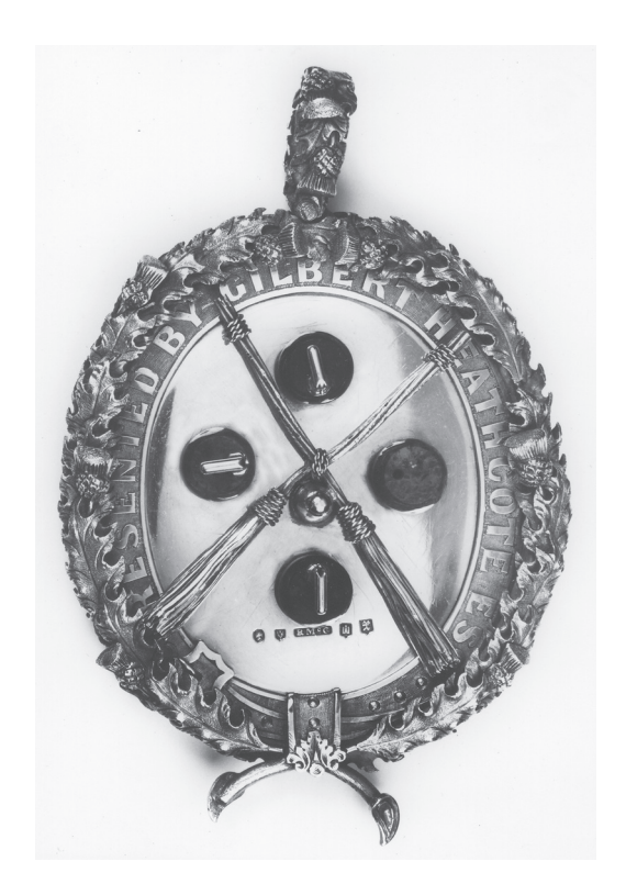
ILLUS 7 Drummond Castle Curling Club, 1854

On the obverse is a band of gold recording the donation, within which are set two pairs of miniature curling stones: one pair of bloodstone with double handles of gold, and the other of granitic stone (said to be from the walls of Sebastopol)<sup>10</sup> with L-shaped handles of gold, with crossed brooms of gold, and a gold tee-marker. The inscription is as follows.