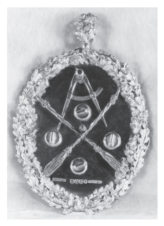
ILLUS 4 Delvine Curling Club, 1846

The club was instituted in 1732 and joined the RCCC in 1842. The medal is in the possession of Delvine Curling Club.