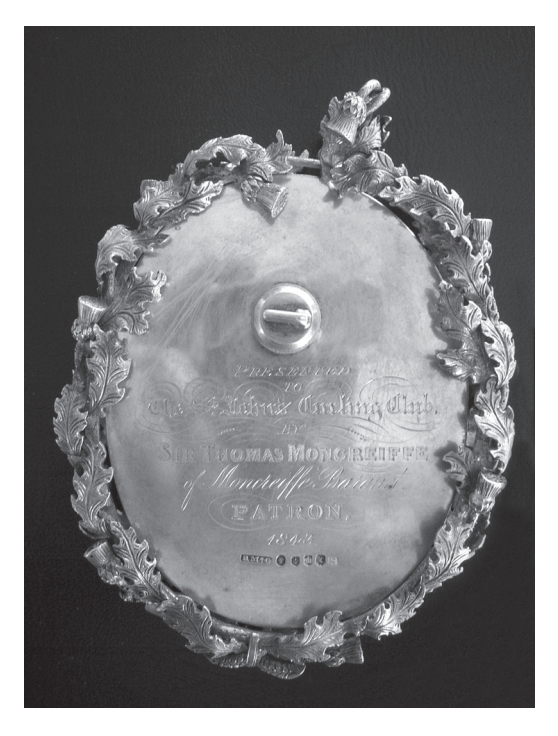
ILLUS 1 St John's Curling Club, Perth, 1842

On the obverse, above the presentation inscription, is a miniature silver curling stone, with an L-shaped handle.<sup>5</sup> The inscription is as follows.