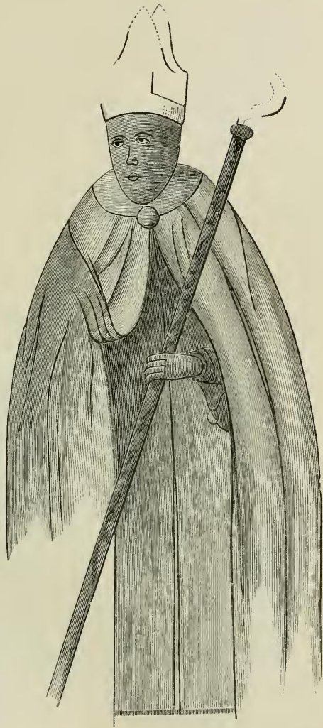
MURAL PAINTINGS FORMERLY EXISTING IN LINGFIELD CHURCH.