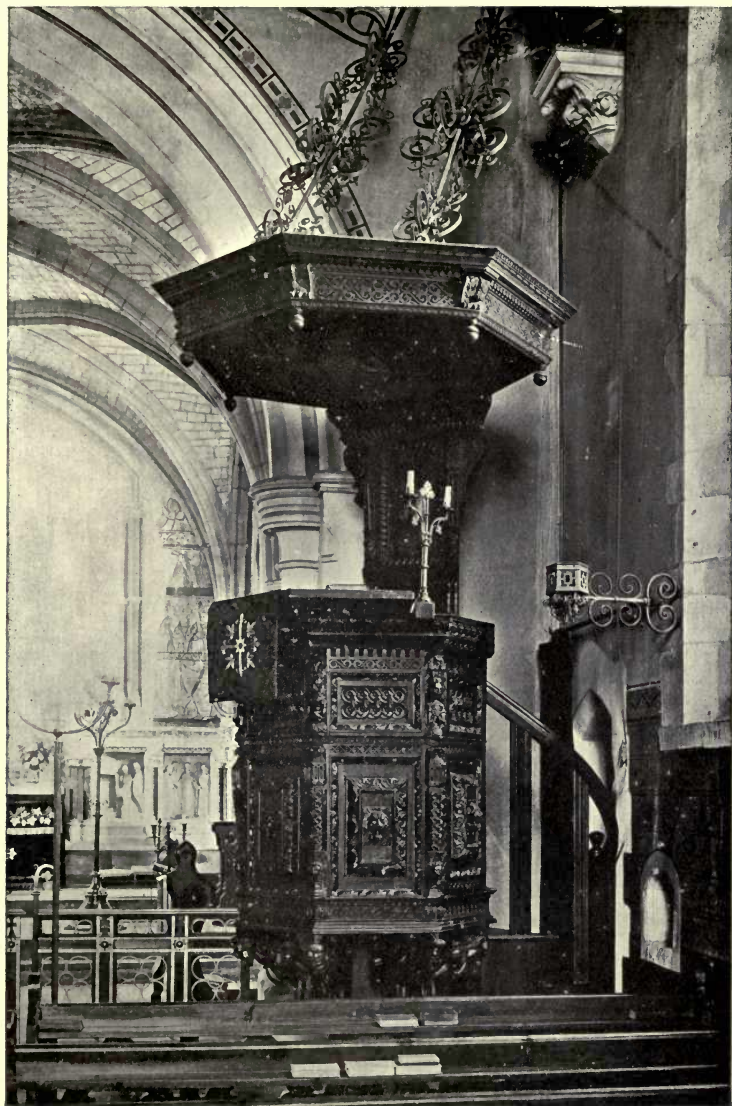
STOKE D'ABERNON CHURCH: THE PULPIT. Showing the Sounding-board, &c., as re-placed.