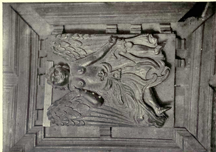
STOKE D'ABERNON CHURCH: SOUNDING BOARD OF PULPIT AND DETAIL.