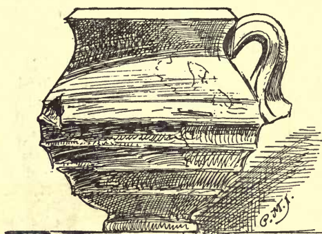
Pot dug up at Champion-Hill.

The pretty little clay pot shown in the accompanying sketch has been dug up by the gardener in the grounds of a house on Champion