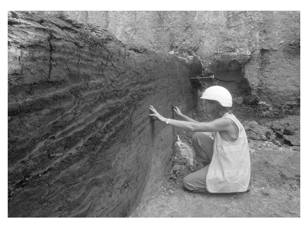
Fig 5 St Christopher House, Southwark Street: section through Bankside Channel.

A late Roman field boundary or drainage ditch was found by C Cowan for MoLAS, cutting through a plough-soil deposit. The ditch fill is dated to 350–400. Also cutting the plough-soil was a medieval pit which contained pottery dated 1270–1500. Both these features were sealed by a 16th century plough-soil deposit. Two post-medieval pits were also found; one is dated to the 16th century. Dumped layers dating to the mid-17th to 19th centuries built up the land and may represent agricultural use. (378)