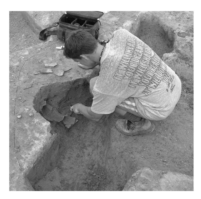
Fig 4 Hengrove Farm, Staines: excavation of an early medieval (late 11th-12th century) pit.

TQ 052 720 Hengrove Farm, Staines (fig 4) Continuing excavation by G Hayman of SCAU revealed further features of Bronze Age, Iron Age and Roman date, as well as some of early medieval origin. Most features dated to the Bronze Age, and included ditches, waterholes, and numerous small pits and postholes. An area of concentration of pits and postholes is likely to have once been a Middle Bronze Age settlement, although no dwellings were recognised, and only one four-posted structure was