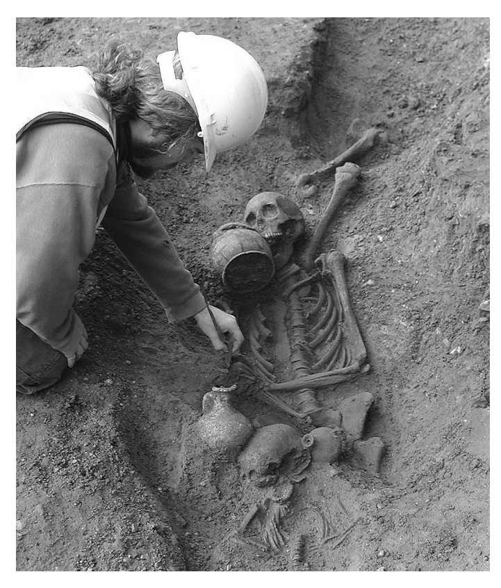
Fig 6 52–56 Lant Street: Roman burials under excavation.

Monitoring took place by B Watson for MoLAS of service trenches along Stoney Street and Winchester Walk; this was a continuation of earlier monitoring (SyAC 88, 360). Along Stoney Street two sections were revealed of masonry foundations of the 13th century kitchen attached to the Great Hall of the bishop of Winchester's Palace (a Scheduled Monument) and another foundation, interpreted as a later addition to the kitchen. There were 16th or 17th century brickbuilt additions to the kitchens, including wall foundations and a possible drain or soakaway. Away from the area of the kitchens was evidence of soil deposits - probably part of the palace kitchen garden post-medieval levelling dumps and rubbish pits. Along Winchester Walk there was extensive evidence of levelling dumps of medieval and post-medieval date. On the site of the bishop of Winchester's stables and tennis court, brick wall foundations and a concrete floored drain of 16th or 17th century date were found. All these structures had been robbed out during the mid-17th century when the present street was created. Later activity on the site of the stables and tennis court