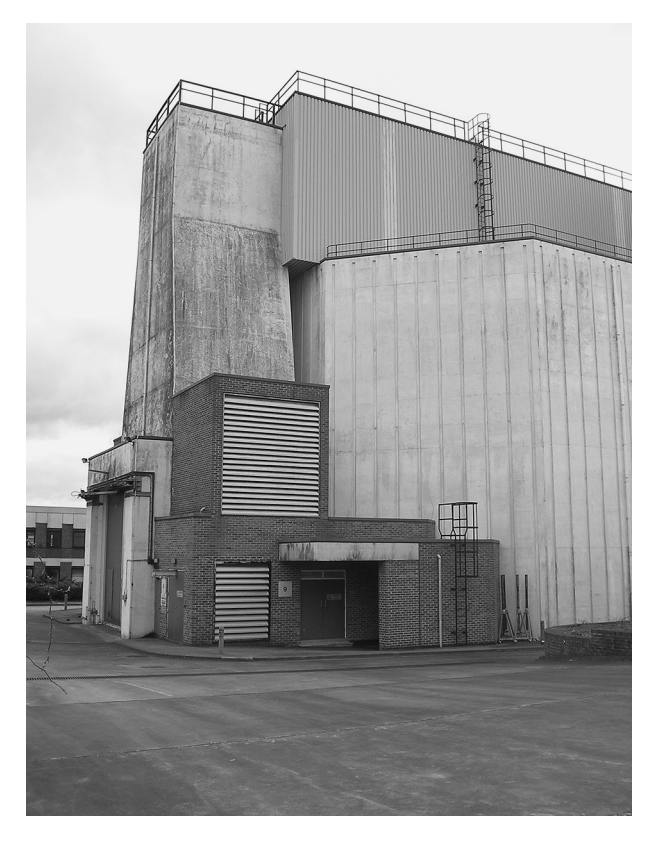
Fig 2 MoD site, Chobham Lane, Chertsey: Climatic Altitude Chamber.

of ArchaeoScape, in collaboration with SCAU, recorded Bagshot Beds overlain by Plateau Gravels, but no finds or features of archaeological interest.