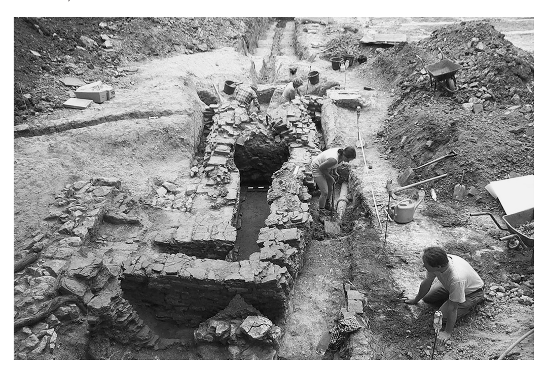
Fig 1 Rosehill, Reigate: excavation of the tile kiln.

SU 976 707 Savill Gardens, Windsor Great Park Geotechnical investigation by C Green and G Swindle