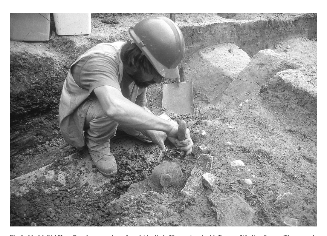
Fig 7 82–96 Old Kent Road: excavation of roadside ditch fill associated with Roman Watling Street.

TQ 332 795 163–167 Bermondsey Street, SE1 (fig 8) J Taylor for MoLAS evaluated the area adjacent to the street frontage, and smaller localised areas towards the rear of the property. The remains of masonry buildings were revealed, several phases of which were identified and provisionally dated to the