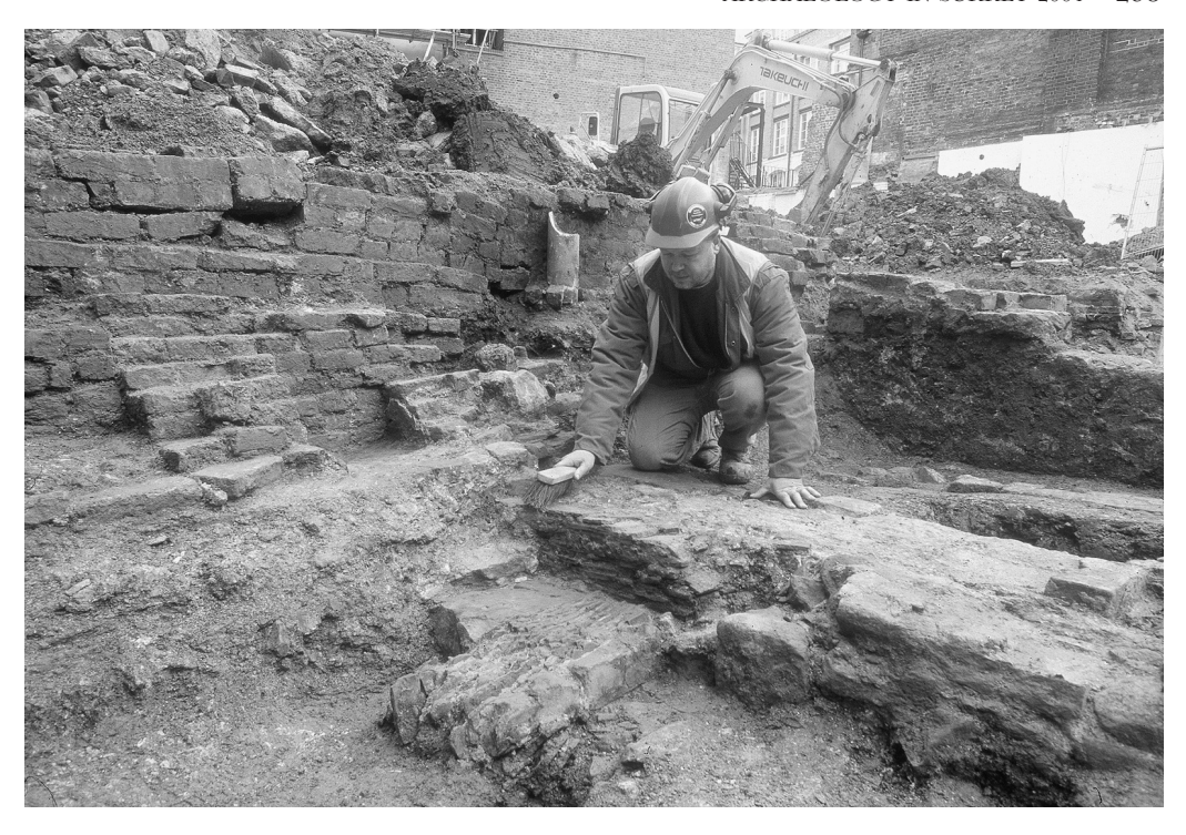
Fig 8 163–167 Bermondsey Street: cleaning post-medieval walls with pitch-tiled hearth in the foreground; in the background is a stone wall associated with Bermondsey Abbey precinct.

medieval period–19th century. Of greatest significance were three substantial east–west ragstone walls which may be surviving elements of Bermondsey Abbey precinct (f. 1082). The south face of the southernmost wall was fully exposed in the localised areas, revealing masonry c1.5m high overlying timber pile foundations. Other significant structural features included medieval chalk foundations for an internal room with a pitch-tiled hearth, and overlying post-medieval brick walls that follow the same building alignment. There was also evidence of a 16th–17th century brick drain and garderobe in an alley between two of the 'abbey' walls. All medieval/early post-medieval masonry has been preserved and protected in situ. (378)