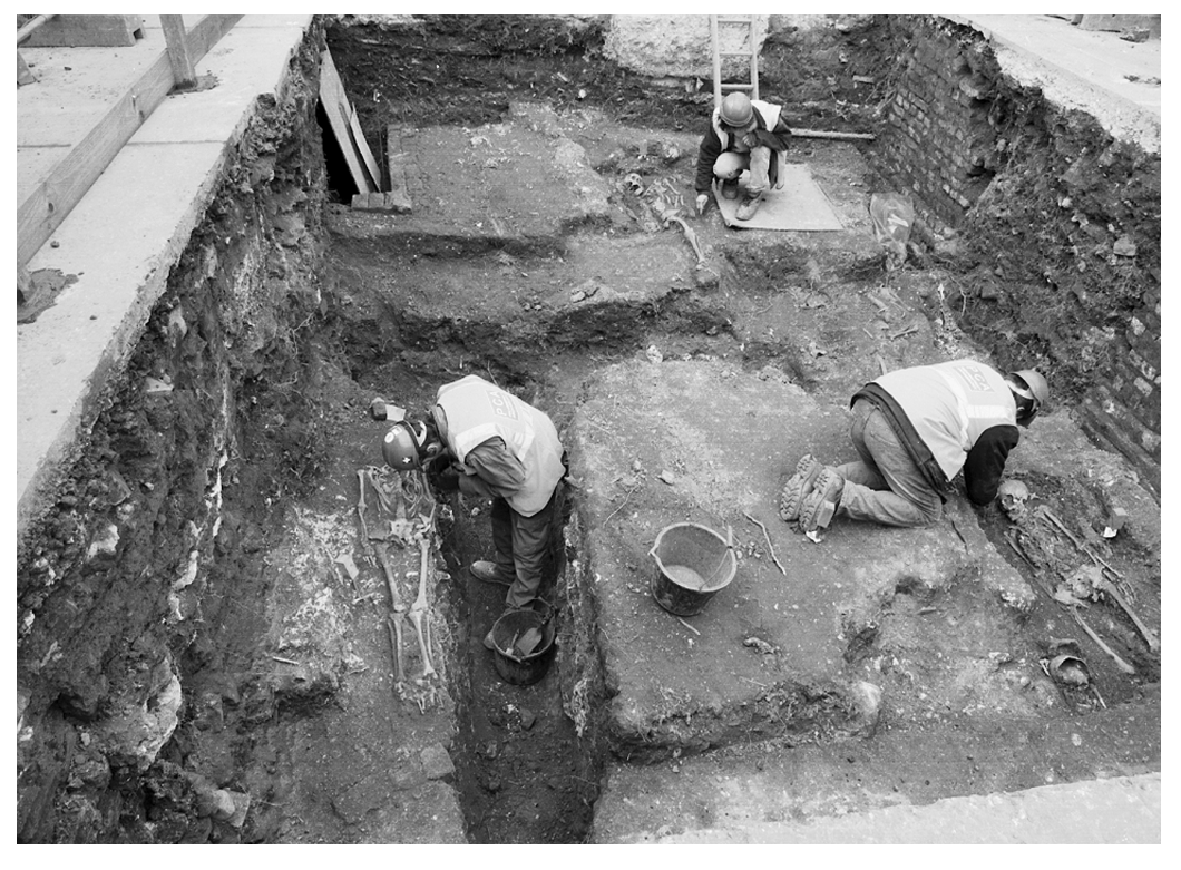
Fig 9 Bermondsey Square: trench 76 looking north-west with 18th century burials exposed.

TQ 336 791 The Final Furlong public house, 162 Grange Road, SE1