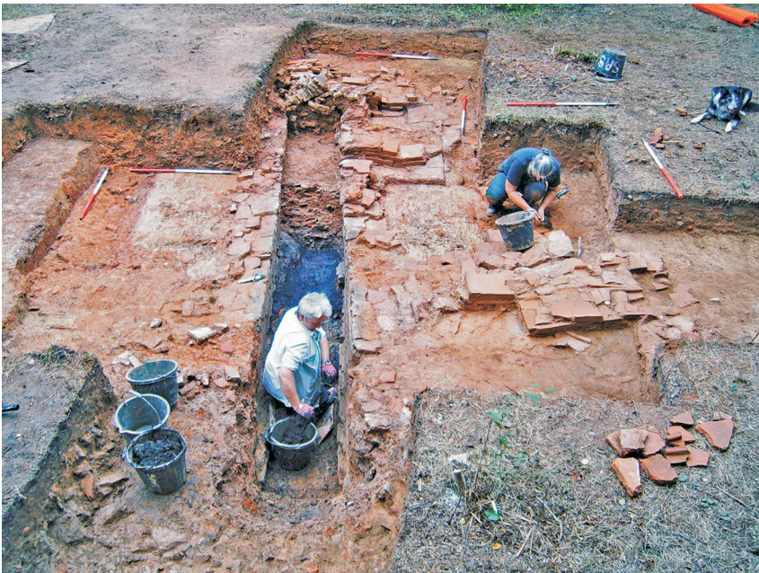
Fig 3 Ashtead Roman villa. The Roman tile kiln under excavation.

Fifth season of fieldwork undertaken by D Bird for the Roman Studies Group of SyAS. Survey and test pitting followed by excavation continue to improve knowledge