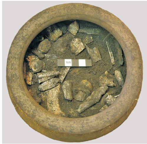
Fig 4 Franklands Drive, Addlestone. (left) Some of the urned cremations under excavation; (above) One of the cremation vessels undergoing investigation in the laboratory.

another feature was tentatively identified as a possible inhumation burial. Two urns of Middle Bronze Age date, one of which was associated with a pit containing burnt stones, were also found away from the main cluster. It was suggested that these earlier features might be significant, as they would most likely have been located beneath barrows that would probably have been visible above ground in the later period, and led to the re-use of the site. Evidence for burial practices of this period is extremely rare in Surrey, and if dating can be secured this would represent one of the most significant cemeteries to be discovered in recent years. Work is ongoing.