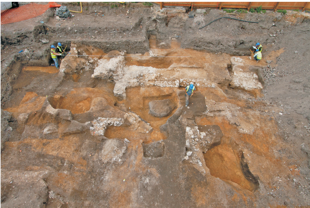
Fig 11 Former Abbey Street Children's Home. Chalk and Kentish ragstone foundation representing the east end of the chancel building belonging to the medieval Bermondsey Abbey church.

Building recording was undertaken by K Hulka for HCOLL. The building dates to 1893–6, designed by Edward Mountford and comprising three storeys with basements and attic and irregular in plan. The bulk of the structure is arranged around a full height hall with ranges projecting forward on either side. To the west of this, a narrow range connects the main school building to a three-storey block that was originally open at ground level with a gymnasium above. The former school is constructed from red brick with Bath stone dressings and retains numerous stone panels with ornate sculpted friezes by Paul Raphael Montford. Internally the principal spaces, such as the main hall, headmaster's chamber and governors' chamber, have survived closely to their original form. The governors' room on the ground floor has an elaborate coffered plaster ceiling with cornice embellished with