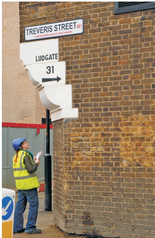
Fig 9 31 Bear Lane, SE1. Corbelled external support of building at the corner of Treveris Street and Bear Lane.

Deposits that probably represent the fill of a channel running approximately north–south were recorded by L Capon of AOC during an evaluation. This channel is known from other sites in the area and is thought to be of Bronze Age or earlier date.