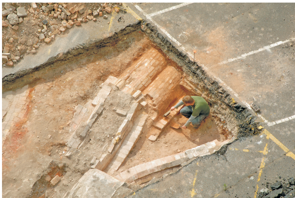
Fig 7 Hampton House, 20–21 Albert Embankment. Flues and foundations of Henry Doulton's late 19th century terracotta works.

A watching brief was carried out by M Miles for CA on a single trench on the east side of the road that exposed