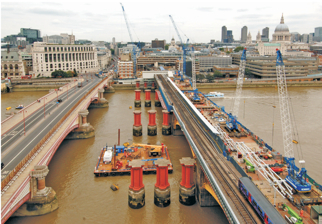
Fig 8 Blackfriars Bridge. View of the bridge under development looking north.