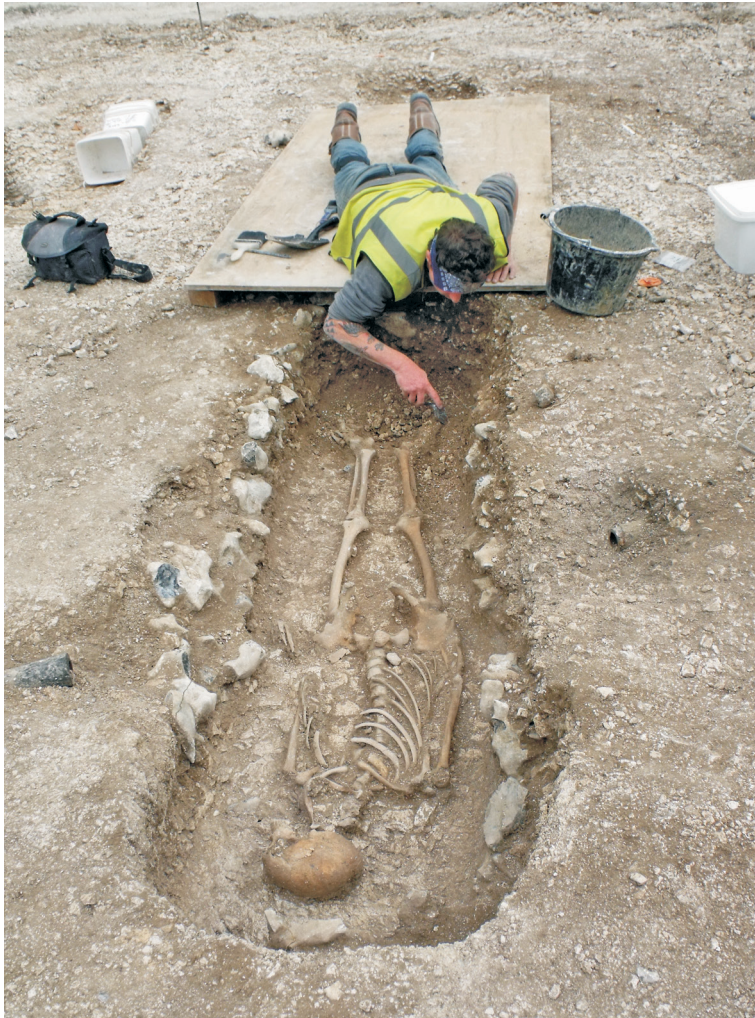
Fig 1 Newtree Furlong, Fetcham. The flint-lined grave of burial 221 under excavation.

2007 and 2010. The farm is located immediately north of the 12th or 13th century Westhumble Chapel. The watching brief identified only foundations associated with late 19th/early 20th century outbuildings, a farmyard sub-dividing wall and associated oak gatepost, and a 19th/20th century brick-built, dome-topped water cistern or possible well (similar to that revealed during monitoring by SCAU at Polesden Lacey in 2008). No evidence of a former farmhouse believed to have been demolished between 1840 and 1883 was revealed, and evidence of development of late 19th or 20th century origin associated with the changing layout and operation of the farm was extensive.