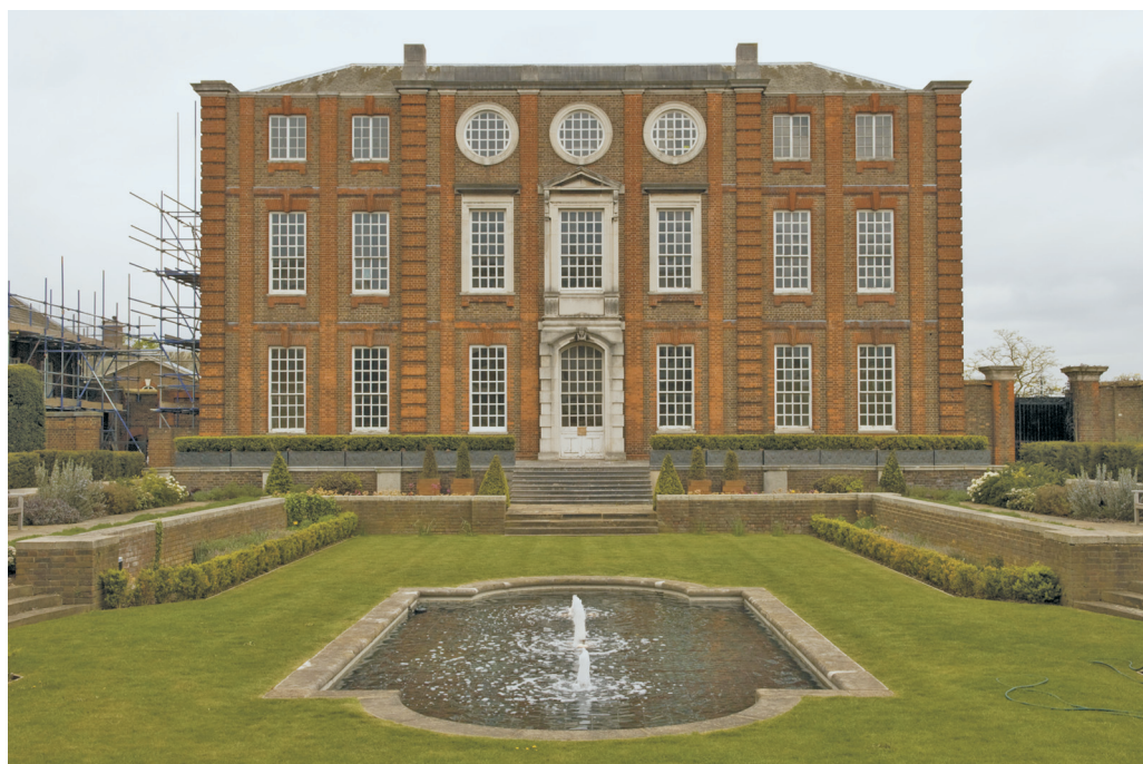
Fig 12 Queen Mary's Hospital, Roehampton. South elevation of Lutyens' south wing, c1911–13, which was added to the c1711–12 Roehampton House designed by Thomas Archer.

TQ 254 751 Osiers Estate, Osiers Road, Wandsworth, SW18