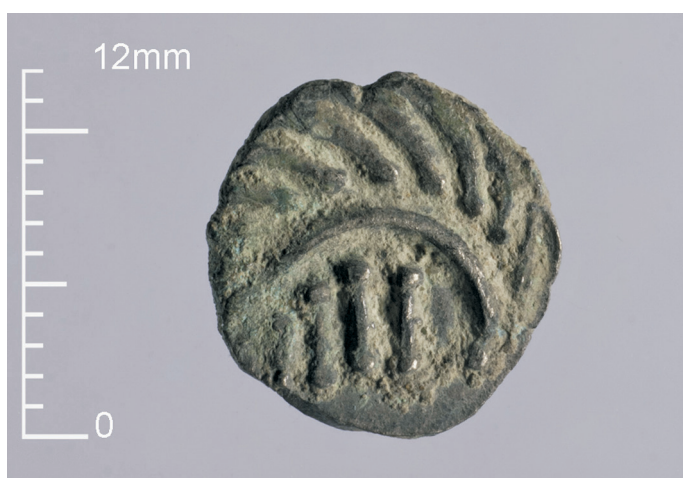
Fig 10 Whitstable Day Nursery. An Anglo-Saxon silver coin or sceat , belonging to Series E and dating to the first half of the 8th century. It was probably minted in the area of Dorestad near the mouth of the Rhine in the Netherlands.

A Haslam undertook an evaluation for PCA, finding that natural brickearth was cut by a Roman pit and sealed by a Roman or Saxon silty sand layer, in turn