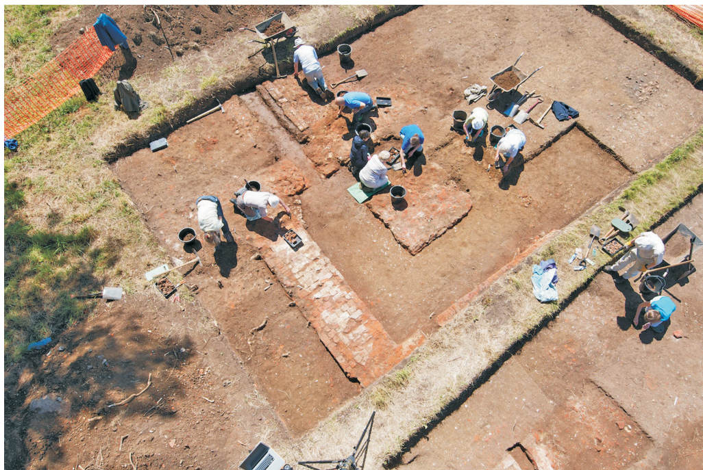
Fig 6 Woking Palace excavations. Tudor brick walls under excavation, with square core (newel) of the staircase visible.

An evaluation, carried out by S Porteus for ASE, found that natural gravels sloped slightly down to the north of the site and were overlain by silty gravels in all trenches, the latter possibly imported to level the site. A slight slope in the natural gravel might indicate that the school site occupied a raised gravel area within the landscape and that it was levelled prior to construction of the school.