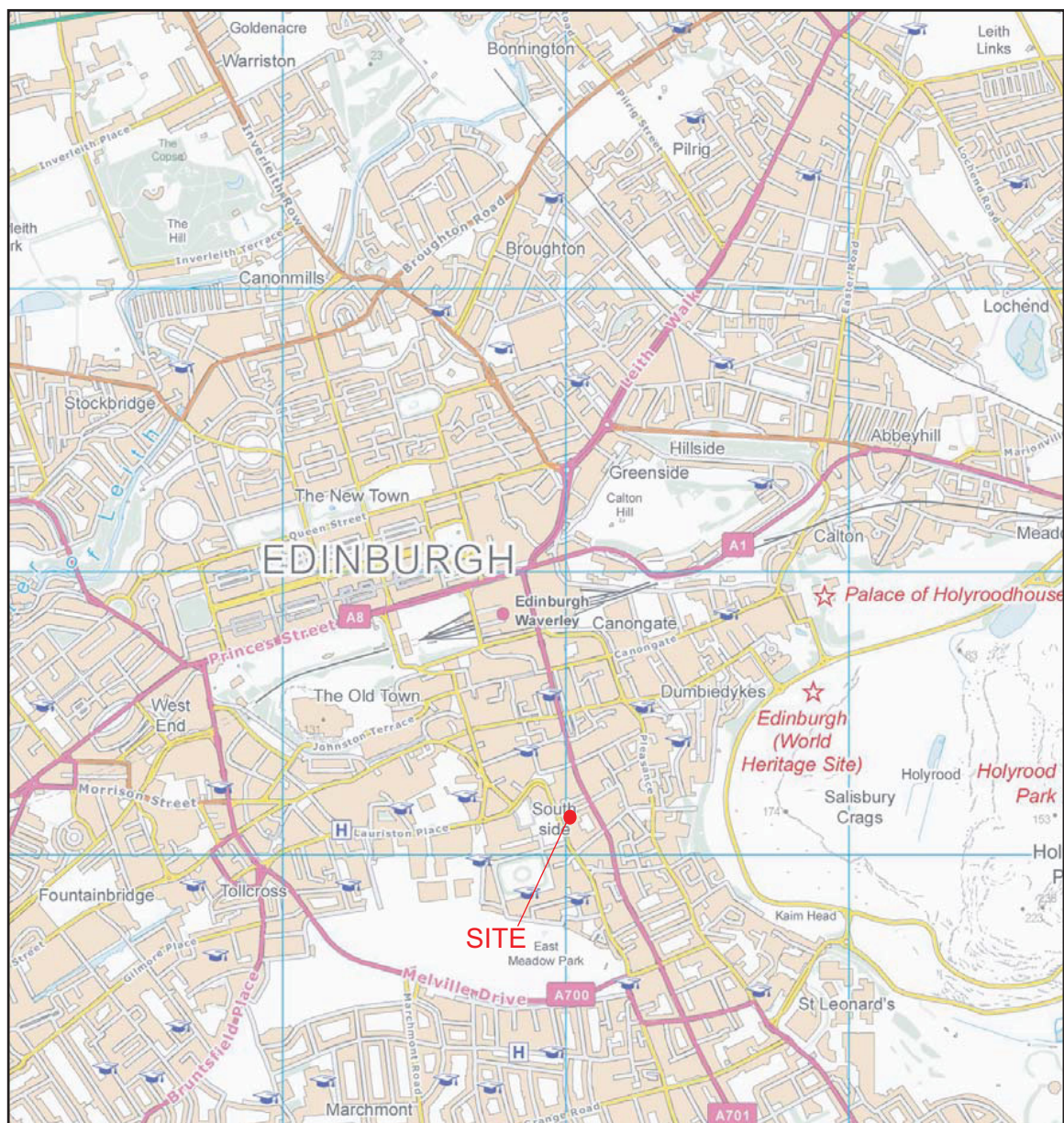
Figure 1: Site location plan