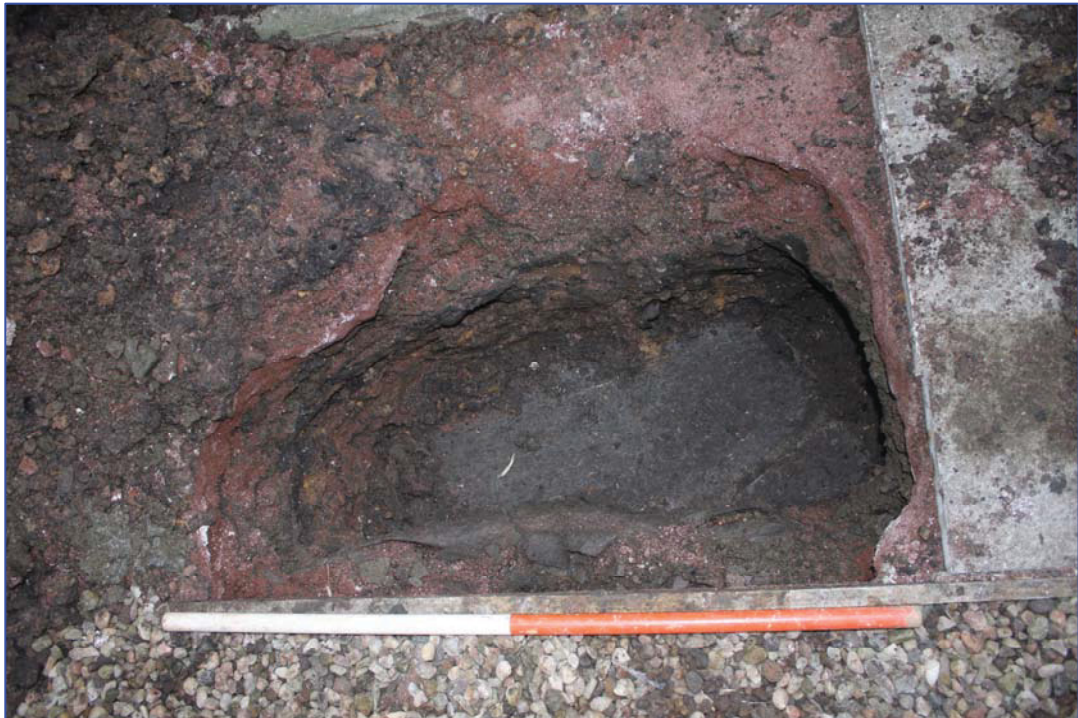
Plate 1: Sandstone slabs in base of Test Pit 1