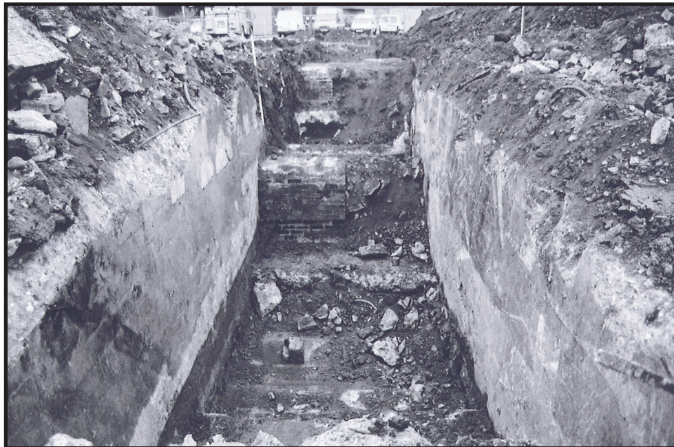
Plate 1 Trench 1 from the est