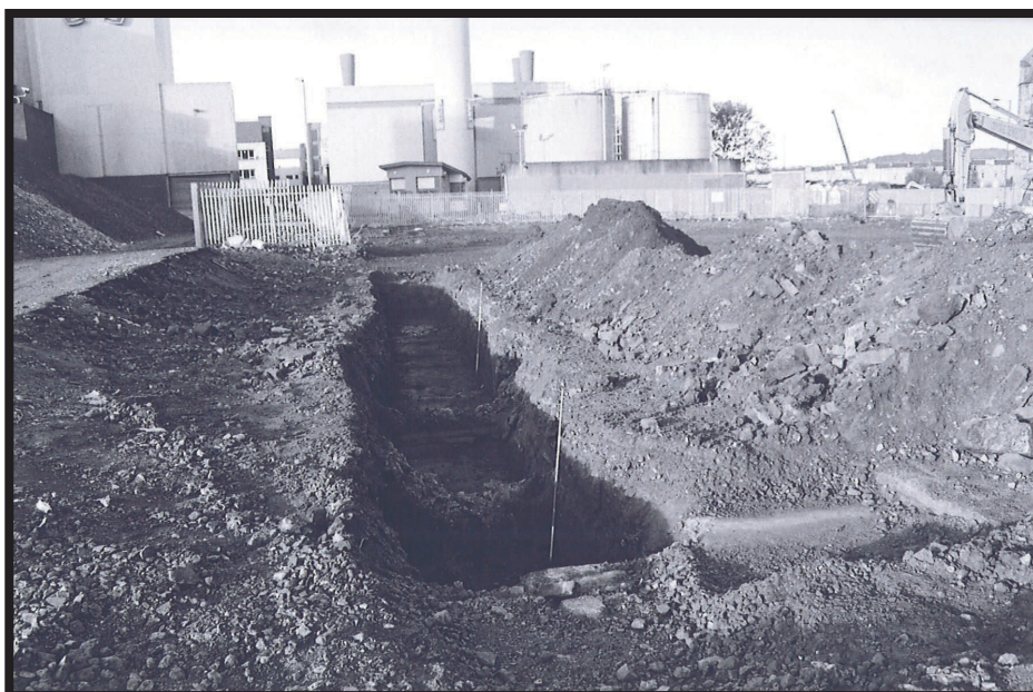
Plate 6 Trench 6 from the east