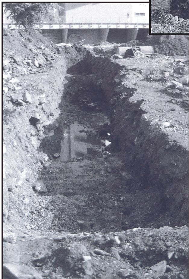
Plate 3 Trench 3 from the west