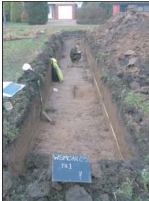
Plate 1 Trench 1 viewed from the south

The only archaeological feature discovered was an irregular channel (feature 19 ), aligned east to west, cut through all the layers of built up silt. This was dated by finds to the seventeenth century.