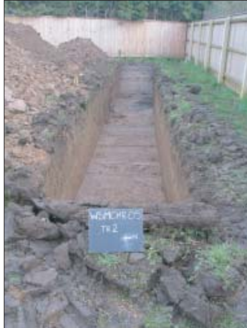
Plate 2 Trench 2 viewed from the west

A possible channel was also noticed (feature 17) aligned south-east to north-west. This feature, however, was not clearly defined and may be natural. It was undated.