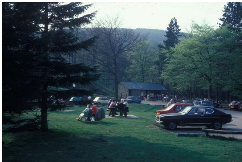
Photograph 9.6. Fairholmes Visitor Centre.

The level of the reservoir rises and falls with demand and rainfall. Dry summers leave a sandy shore exposed, which attracts picnickers, dog walkers and sunbathers as well as the occasional fieldwalker looking for archaeological artefacts. Today the level is low enough to expose the remains of Derwent Village, which attracts visitors with its imagery of the drowned and lost village. Across the reservoir, the land rises in a series of shallow slopes to Derwent Edge. The lower valley side is still farmland, crossed by dry-stone walls that form the small, irregular fields that originated in the medieval period. Many walls are ruined or missing and their lines can sometimes still be traced as lynchets. The farmland is now all pasture, and is shared between two farms owned by the National Trust. This and the moorland above are managed to benefit the complex relationship between upland farming, recreation and conservation of heritage and wildlife. These have not always been easy bedfellows, and the demands of one may risk the security of the others. Stone needed to repair a gap in a wall is easiest obtained from ruined walls nearby, but that threatens the fabric of the historic landscape. Keeping sheep levels low to promote heather regeneration and wildlife may threaten the financial viability of the farm. The National Trust attempts to juggle all of these with recourse to traditional forms of land-use, allied to management plans, archaeological surveys and ecological assessments.