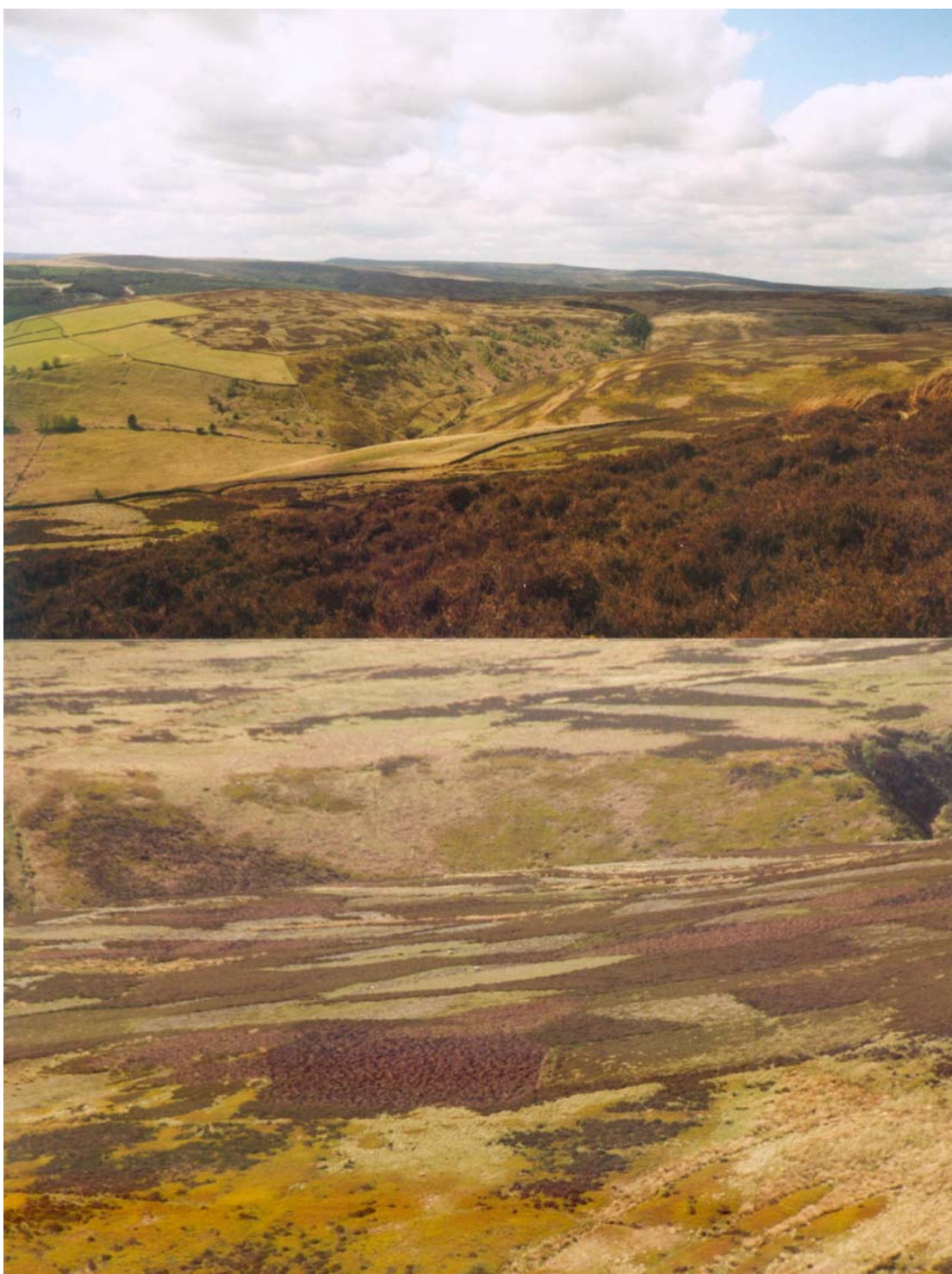
Photograph 9.2. Heather burning on Derwent moors creates a patchwork of different aged heather

The Derwent bus from Sheffield drops down into Ladybower Gorge along the A57, along the route of Thomas Telford's 1821 Sheffield to Glossop turnpike. To the right the