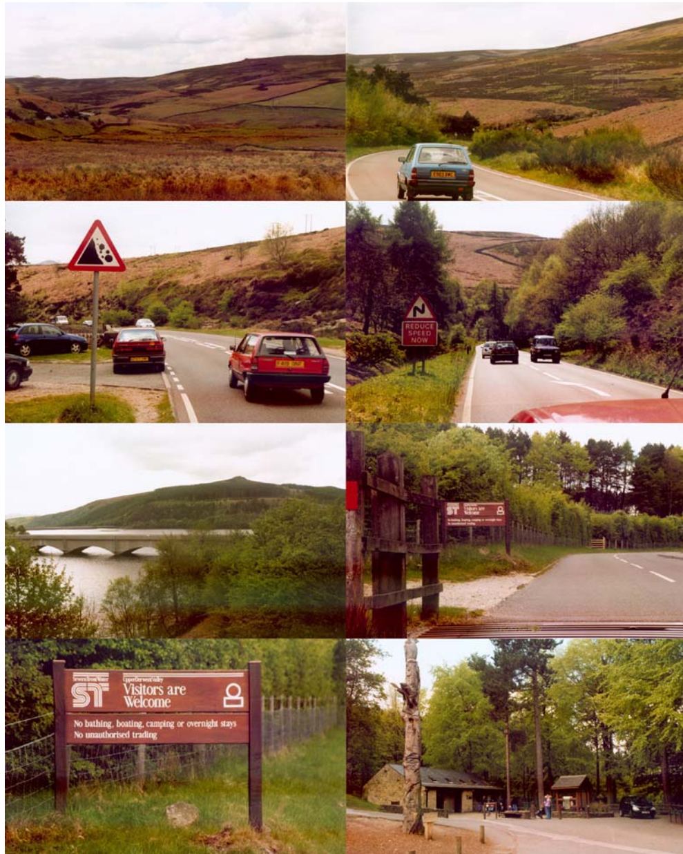
Photograph 9.1. Travelling to Fairholmes along the A57 from Sheffield