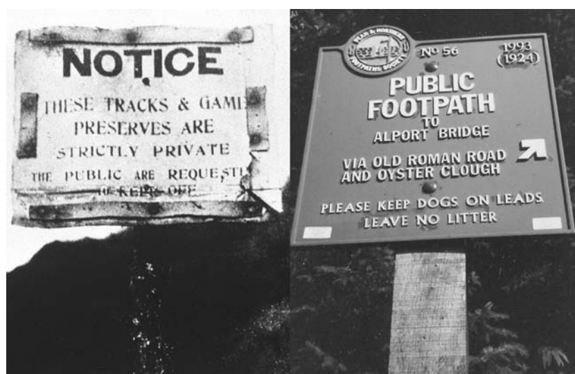
Photograph 9.7. Contrasting signs aimed at ramblers in the 1920s. A landowner's stop notice (left) and a waymarker of the Peak District and Northern Counties Footpath Society (right)

The expansion of leisure was becoming more inter-linked with the conservation movement than in the previous century, as preservationists believed rambling improved moral spirit, good health and a culture of citizenship developing internal order, discipline and the 'art of right living' (Joad 1934). Many national societies were founded, or amalgamated out of earlier regional clubs, for touring the countryside with rules of conduct for respecting the landscape. The Youth Hostel Association and the Ramblers Association were two of the most well known societies founded in the 1930s. They promoted the ideal that the countryside was to be preserved from encroaching development and decrees were made as to what was appropriate enjoyment of the countryside – quiet and litter-free tenets which would later be enshrined in National Park policies. Open-air enjoyment was seen as a 'movement' and part of the modernist field of art and architecture. Hobnail boots, backpack and map defined the walker's identity (Stephenson 1946).