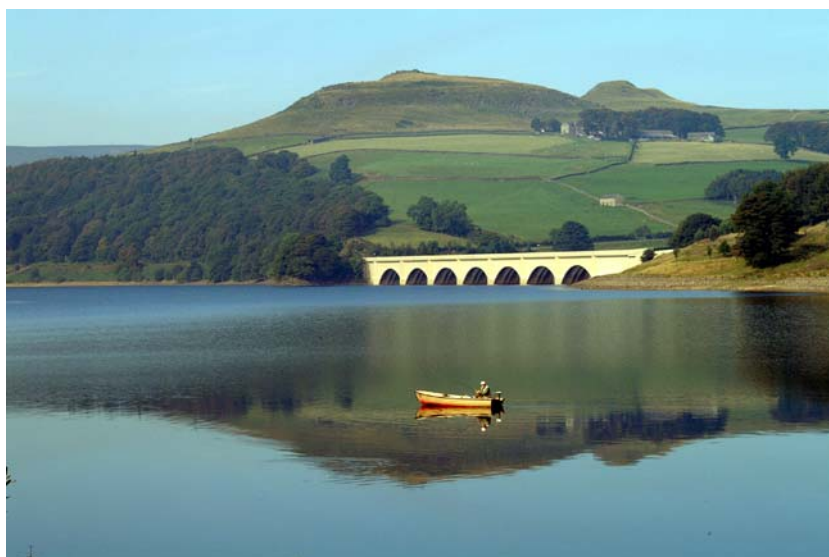
Photograph 9.3. Fisherman on Ladybower Reservoir, Ashopton (A57) viaduct and Crookhill.

Heather burning is practised across all the moors to renew old stems with new shoots that feed grouse, sheep, mountain hare and curlew. The National Trust moorlands use this 'traditional' management, designed for grouse and sheep, to benefit wildlife. Many species live here with little conflict with other uses of the moors, though the foot and mouth restrictions on walkers in 2001 allowed their numbers to flourish due to an undisturbed breeding and nesting season in that year.