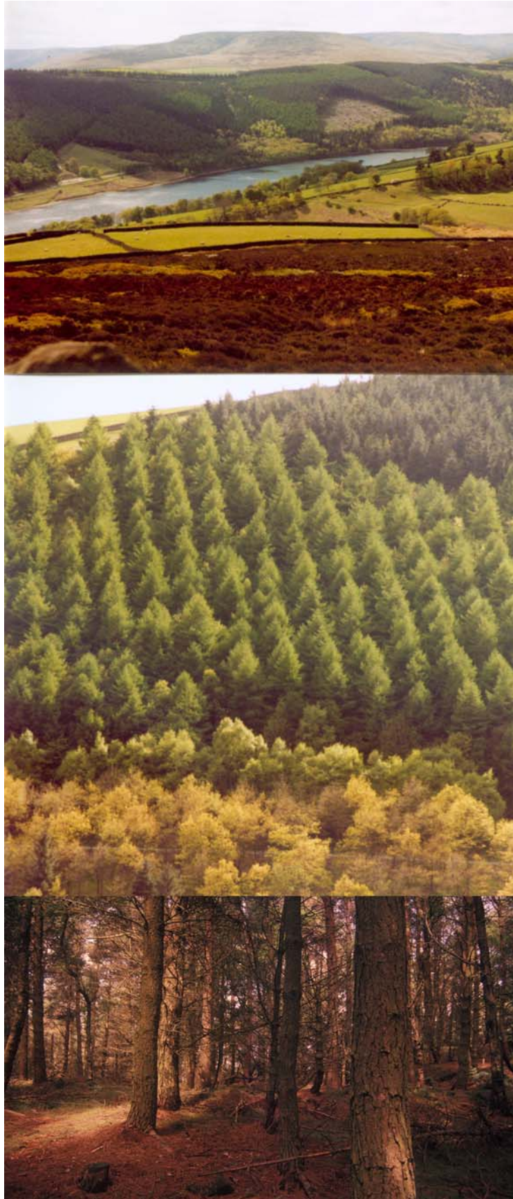
Photograph 9.5. Conifer plantations. Top – the landscape character of the valley side plantations. Middle – regimented rows of trees the same age and same species. Bottom – inside a plantation