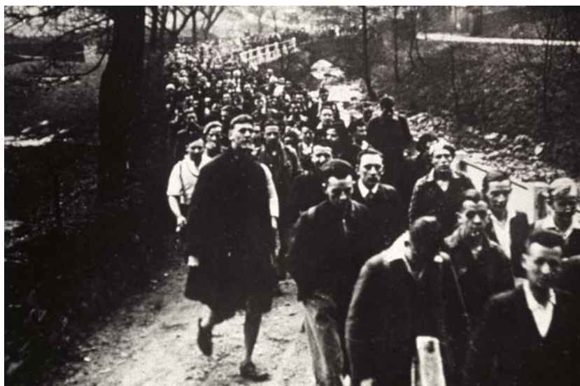
Photograph 9.8. Kinder Mass Trespassers, 1932.