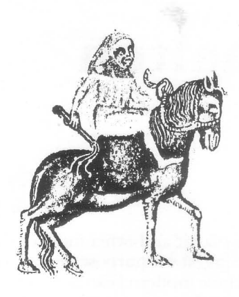
Fig. 3: man riding a horse with an empty flour-bag across his saddle. The horse wears a halter, but no bit. British Museum Add. MS 42130 "Luttrell Psalter" f158.

Men and women rode when they wished to travel and apparently in the 14th century the only people who travelled in wagons were the women of the court. Immense quantities of goods, however, were carried around the country in a variety of heavy and light carts and wagons<sup>26</sup>. Records<sup>27</sup> and depictions show that the carts were normally pulled by horses rather than by oxen. Much of the carriage of goods was done by packhorses. These were useful where roads were not good enough for carts or wagons; they came into their own especially during winter and in upland areas. They were used in