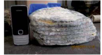
Original report photo (Tarmac)

The occlusal surface (biting part of the tooth) suggests a young adult animal with fairly primitive teeth, possibly Mammuthus trogontherii , the steppe mammoth. This species is associated with reasonably warm conditions and an open environment.