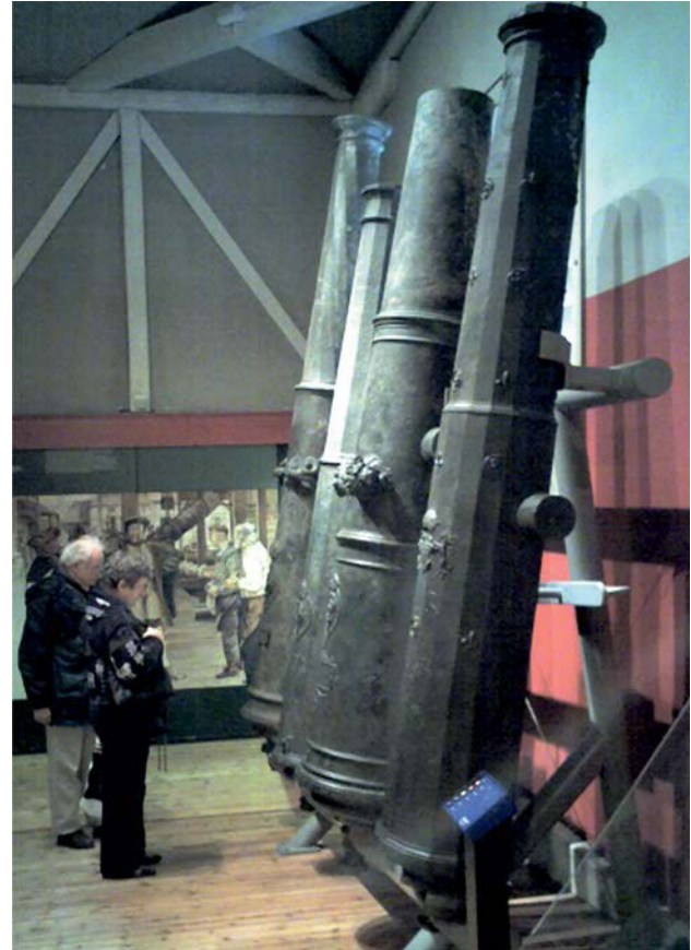
Front two demi cannon, back two culverins

Not all cannonballs are simply round shot. Others were adapted to cause maximum damage to an enemy's ship.