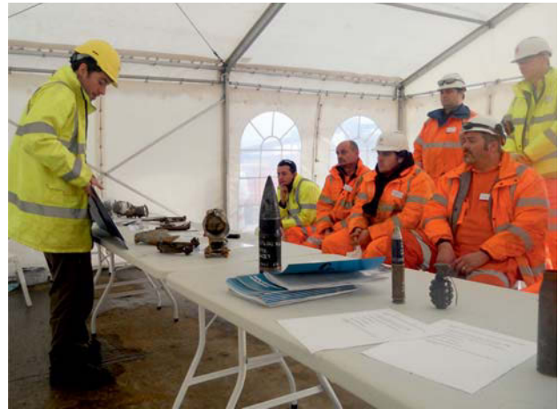
Safety day at Tarmac's Greenwich Wharf

Get in touch with the team on: protocol@wessexarch.co.uk or call 01722 326 867