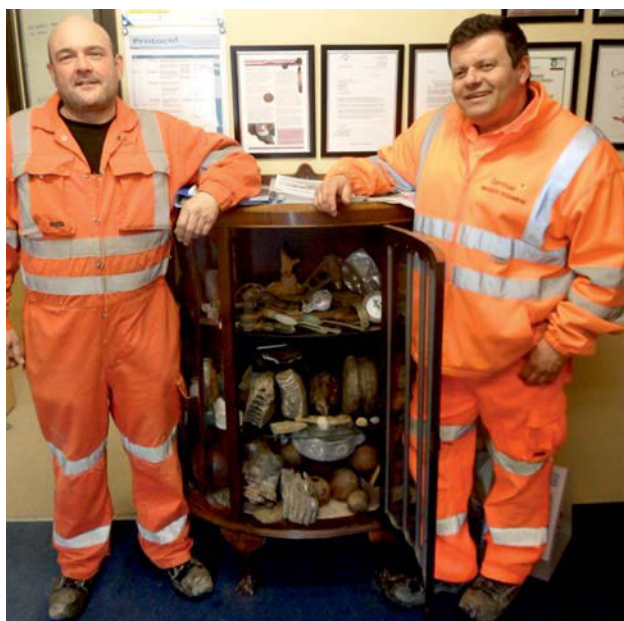
Site Champions at Greenwich Wharf

Best Find - Schermuly naval rocket line thrower