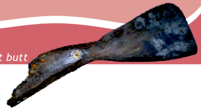
Matchlock musket butt