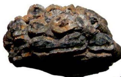
Mammoth Tooth - Mammuthus meridionalis