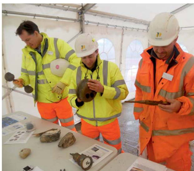
Safety day at Tarmac's Greenwich Wharf

Welcome to Issue 12 of Dredged Up, the newsletter of the BMAPA / TCE / EH Protocol Implementation Service.