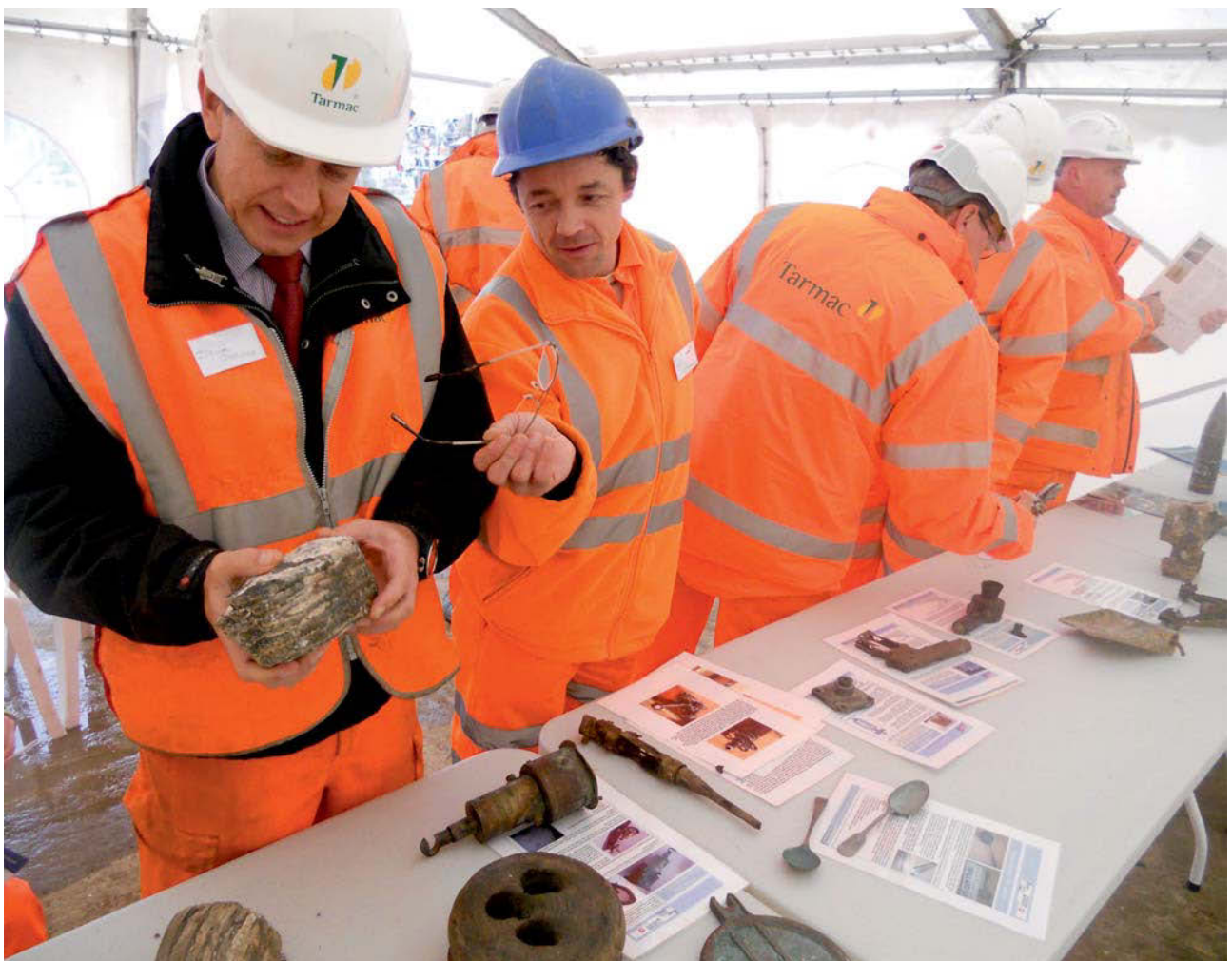
Tooth at Tarmac's Greenwich Wharf