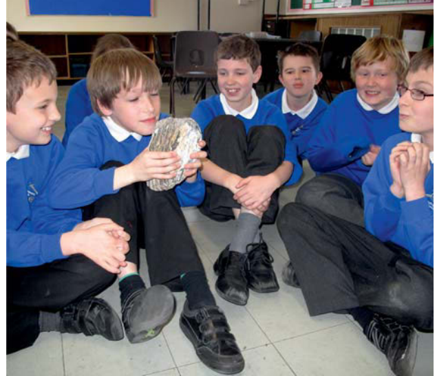
Tooth on a school visit

It has also visited wharves and been handled by wharf staff all around the country as part of the Awareness Visits that we deliver to support the Protocol. Find out more about these visits and how to book yours on page 8.