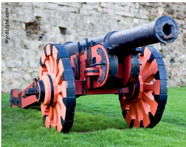
Demi-culverin circa 1587

It is important to remember that cannonballs dredged from the sea may have changed from their original size and weight due to damage caused either during firing or time spent on the seafloor.