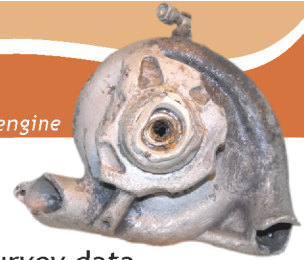
Hanson: Jumo engine