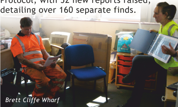
Brett Cliffe Wharf

Dredged Up is back for issue 13. The 2012-2013 reporting year has just finished and it has been another incredibly successful year for the marine aggregates Protocol, with 52 new reports raised, detailing over 160 separate finds.