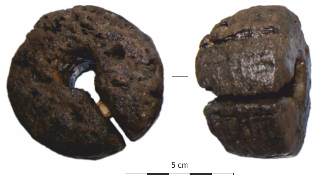
CEMEX: fishing float

Conversely, CEMEX's Sand Fulmar reported the discovery of a fishing float from area 319 on the east coast. Found with a small assemblage of other finds (including animal bone and fossilised teeth) this cork float would have been attached to the top of fishing nets to keep them hanging upright in the water column. This example has a vertical slit through the side of the find, showing where the broken float has become detached from the net to end up adrift in the sea.