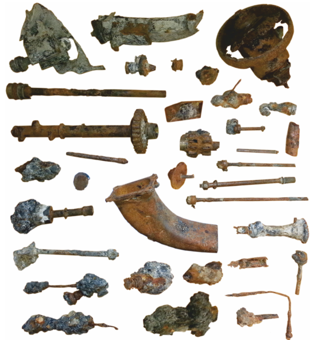
Lafarge Tarmac: aircraft remains