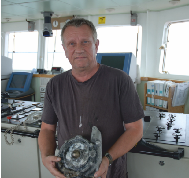
Hanson: Jumo engine remains

The material from area 395/1 is intriguing. Spread (currently) over seven separate reports from two separate companies we have the remains of a Jumo engine and part of a Junkers 87 Stuka dive bomber. Stukas flew with Jumo engines though the most recent engine piece retrieved (found by the Arco Dee ) is from a version of the Jumo not fitted to the model of Stukas which were flown over the UK. This is fascinating and slightly daunting as it means there are potentially the remains of two separate aircraft scattered within the licence, so we need to stay vigilant to see if together we can further narrow down the position of these losses.