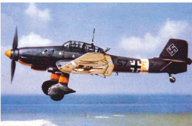
Junkers 87 Stuka dive bomber

The material from area 395/1 is intriguing. Spread (currently) over seven separate reports from two separate companies we have the remains of a Jumo engine and part of a Junkers 87 Stuka dive bomber. Stukas flew with Jumo engines though the most recent engine piece retrieved (found by the Arco Dee ) is from a version of the Jumo not fitted to the model of Stukas which were flown over the UK. This is fascinating and slightly daunting as it means there are potentially the remains of two separate aircraft scattered within the licence, so we need to stay vigilant to see if together we can further narrow down the position of these losses.