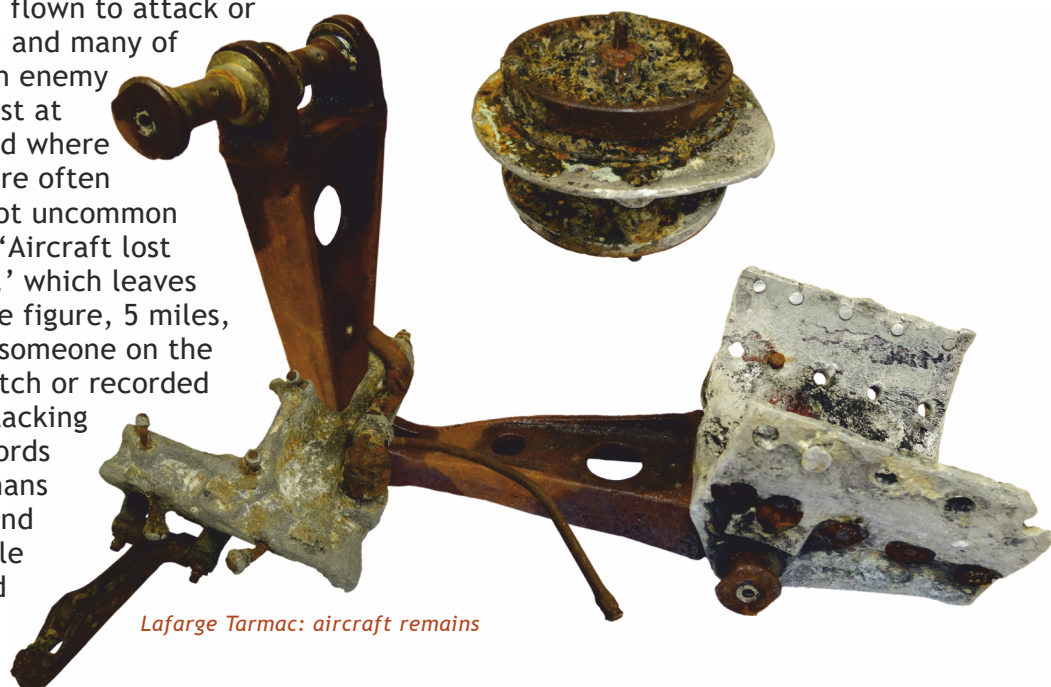
Lafarge Tarmac: aircraft remains

This presents a practical problem as WWII aircraft flew heavily armed and therefore aircraft wreck sites are likely to contain ordnance. Also they may of course contain human remains and are protected under UK law (Protection of Military Remains Act 1986).