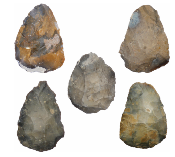
Hand Axes reported from Licence Area 240

The work proved successful and several Palaeolithic finds were recovered including worked stone, a mammoth tooth and a bone thought to have come from a red deer.