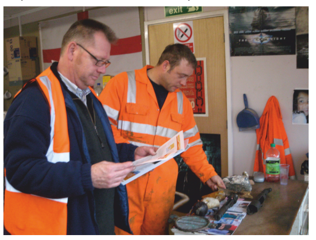
Brett Ipswich Wharf

Welcome to Issue 14 of Dredged Up. The 2013-2014 reporting year is in full swing and to date 28 reports have been raised through the Protocol in this, the ninth year of Protocol reporting. The Protocol Implementation Service expect to receive