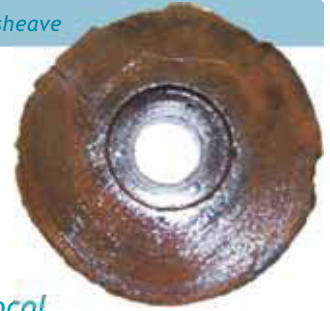
Wooden pulley sheave