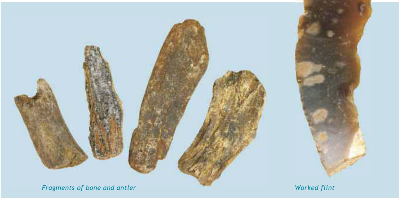
Fragments of bone and antler