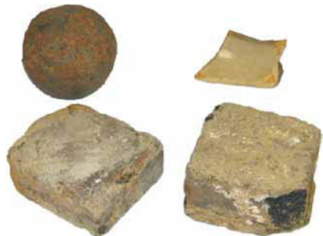
Cannon ball, pottery and brick assemblage