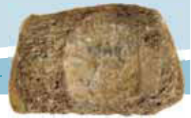
Piece of antler