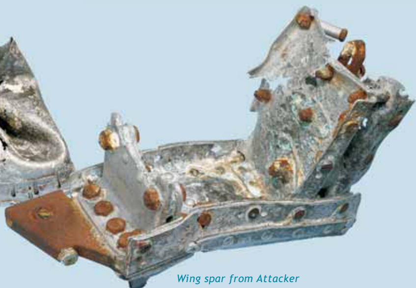
Wing spar from Attacker