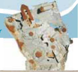
Wing spar from Attacker