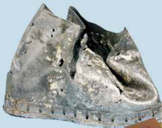
Cowling from Attacker engine

The Joint Casualty and Compassionate Centre at RAF Innsworth are always made aware of the discovery of such sites as aircraft are automatically designated as protected places under the Protection of Military Remains Act. The Joint Personnel Accounting Command branch of the American military based in Hawaii has also shown interest in the Implementation Service.