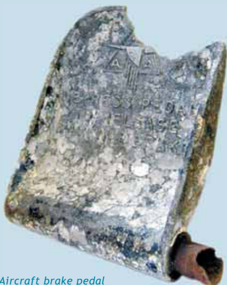
Aircraft brake pedal with 'NAA' logo

At present wharves have been advised to report all ferrous artefacts that are either unusual or readily identifiable as part of a ships equipment.