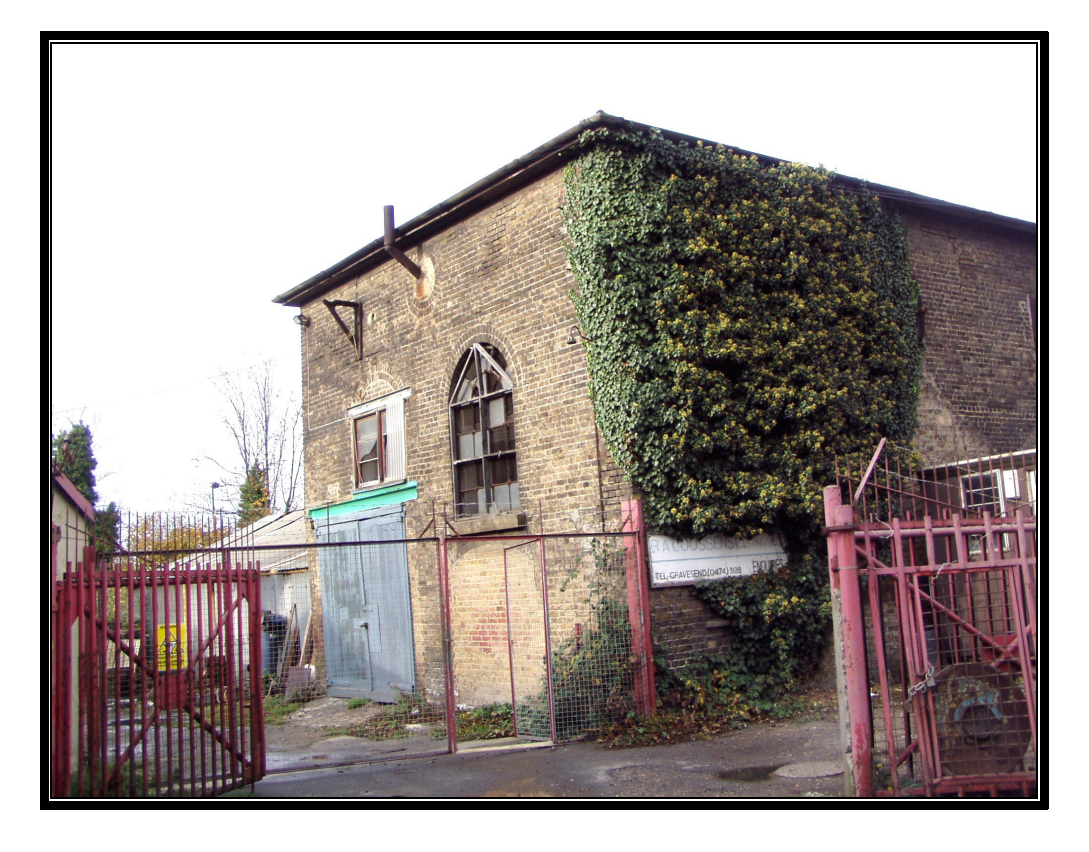
Plate 4: ?Cement storage building at Aspdins Cement Works (KN558)