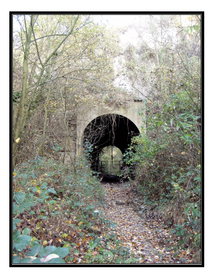
Plate 5: Craylands Gorge Tunnel, Swanscombe (KN877)