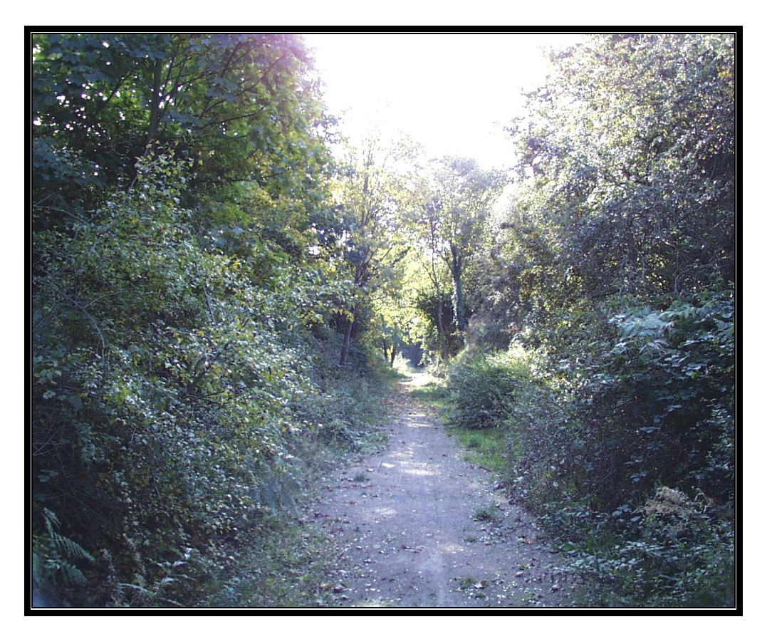
Plate 3: Tramway cutting (EX 649)