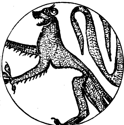
(Tonsure Plate used at S. Paul's.)

COMPANION VOLUME TO "CHAPTERS IN THE HISTORY OF OLD S. PAUL'S."