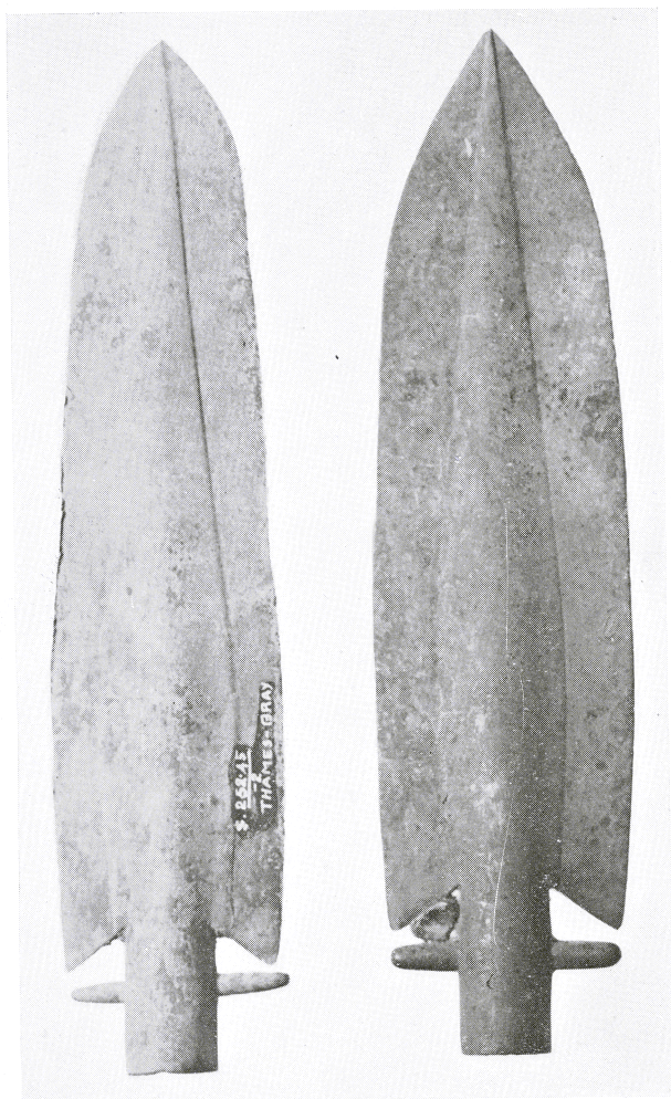
Late Bronze Age. Socketed and Barbed Bronze Spearheads. Scale approximately 1 : 2.