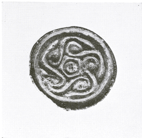
B. Pagan Saxon. Gilt Bronze Saucer Brooch. Scale 6 : 5.