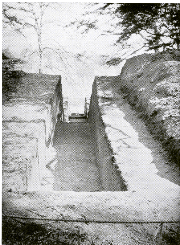
PLATE Ia—Trench A, looking E. from the interior.