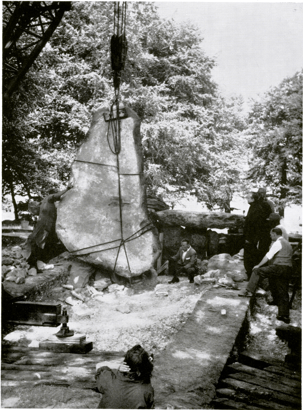
Plate I. Re-erection in July 1962 of one of the fallen facade stones at Wayland's Smithy by the Ministry of Public Buildings and Works