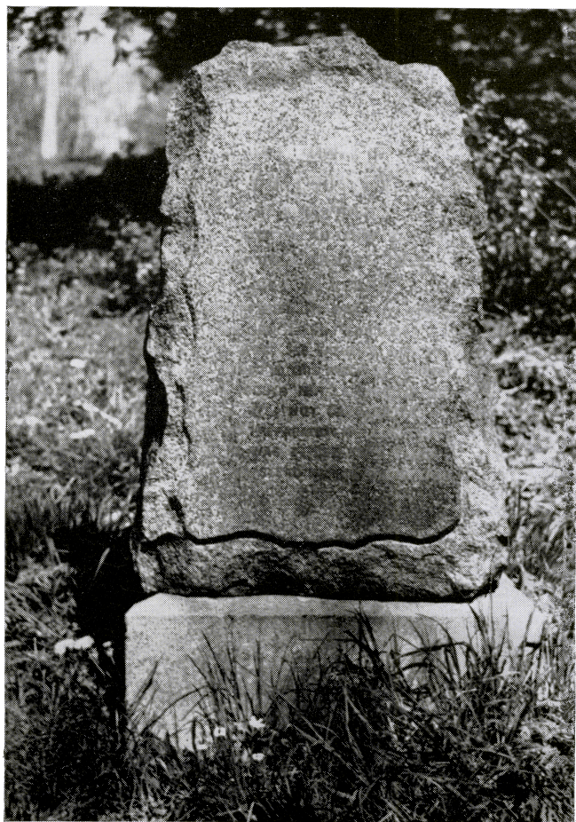
(b) MEMORIAL STONE TO JOB LOUSLEY. Situated in Beech Wood, Hampstead Norris