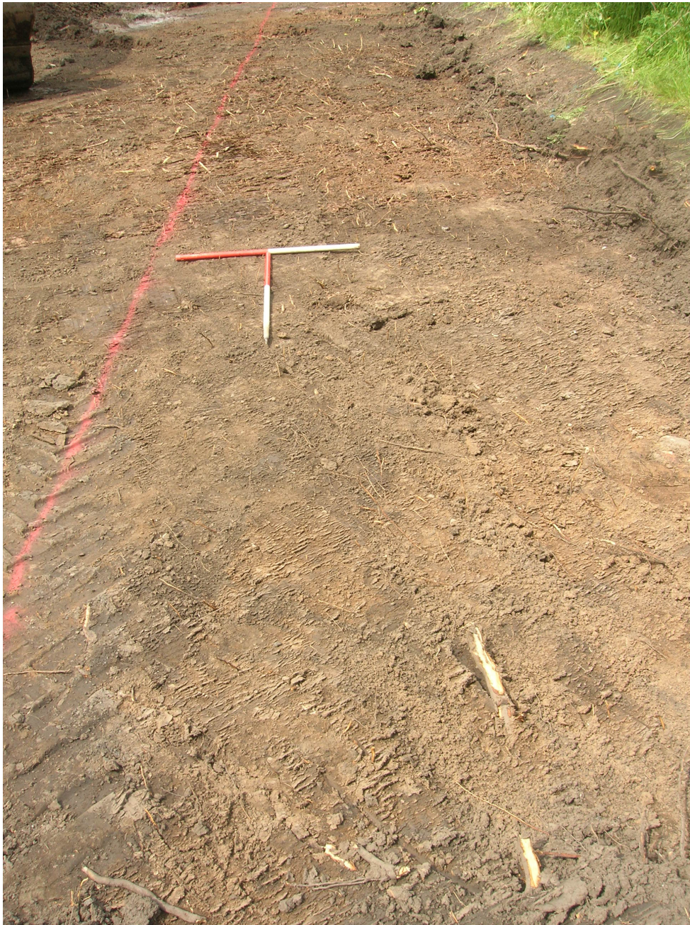
Fig. 2 - Area immediately to the north of the tennis court