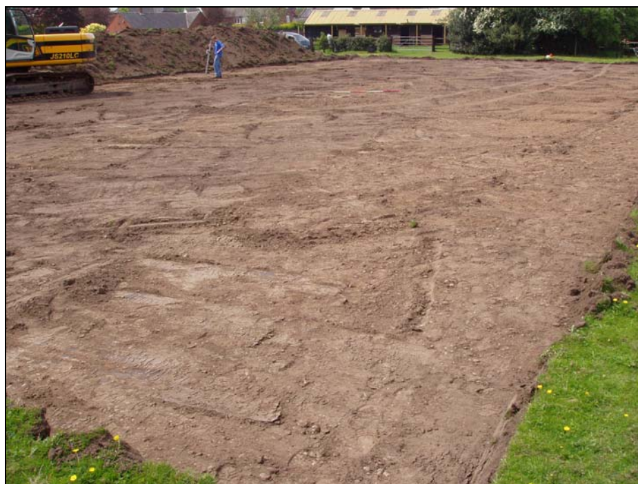
Plate 2: final view of the site strip before it was machine tracked and consolidated prior to laying of the a 'terram' type netting and loose foundation stone