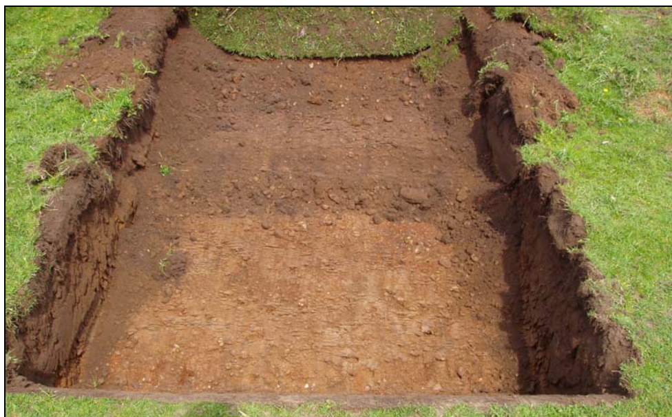
Plate 4: view of the soak-away, situated at the site's southern corner, looking north-east