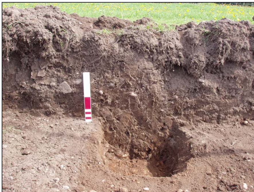
Plate 3: hand excavated sondage to show the underlying natural gravel and the truncated the sub soil which is marked by a line of stones (bisecting the middle of 0.2m scale), looking north-east