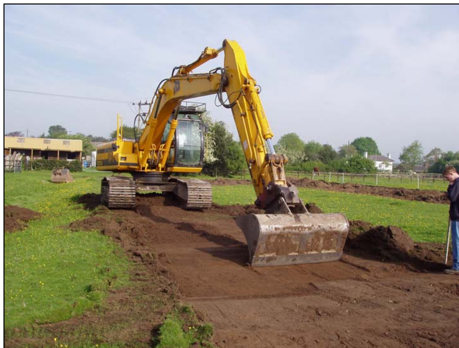
Plate 1: view of the 360° excavator which undertook the site strip, that involved the reduction of topsoil and in some areas (along the ridges) the truncation of the subsoil