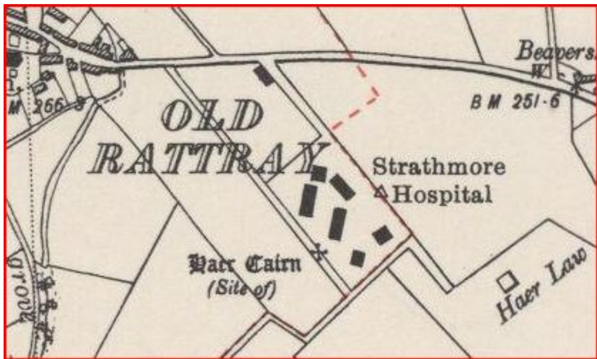
Illus 3 Development site occupied by buildings of Strathmore Hospital as shown on Ordnance Survey Second Edition map of 1948