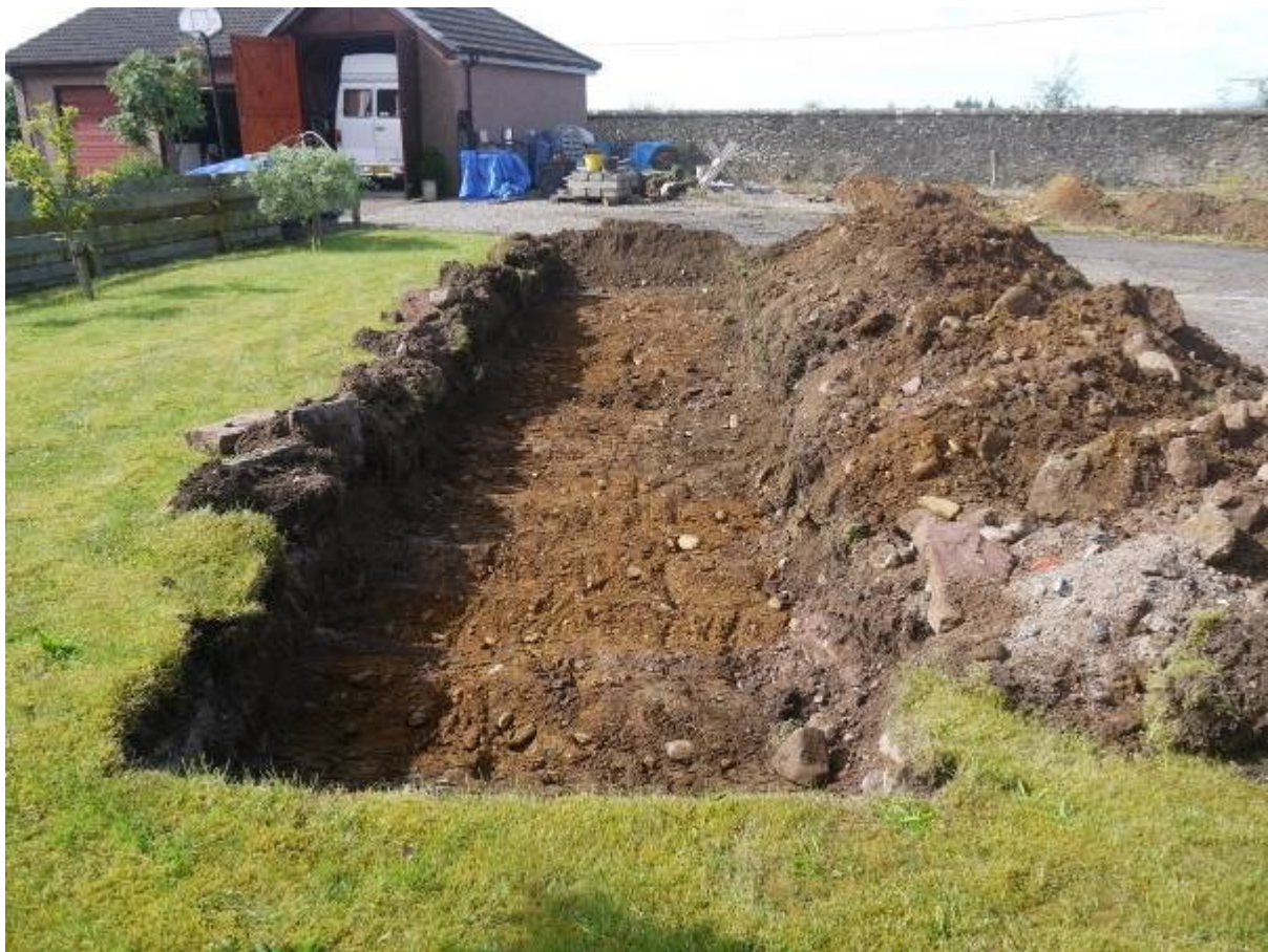
Illus 7 Trench 2 fully excavated looking West