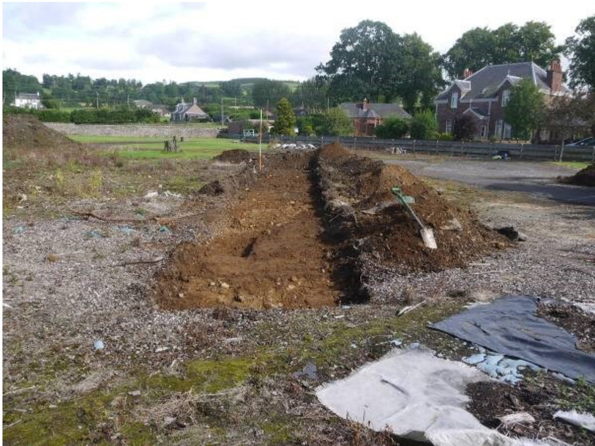
Illus 5 Trench 1 fully excavated looking North North East