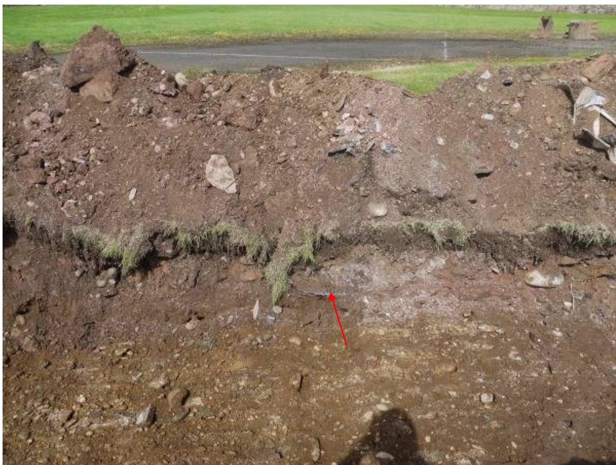
Illus 10 Trench 3 looking North showing remains of demolished hospital building and bitumen floor in trench section (indicated by red arrow)