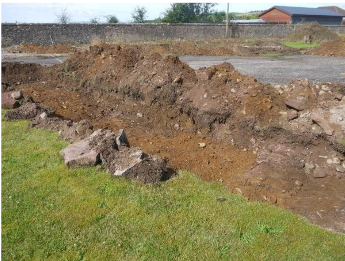
Illus 8 Trench 2 fully excavated looking North West, demolished building remains visible in trench section.