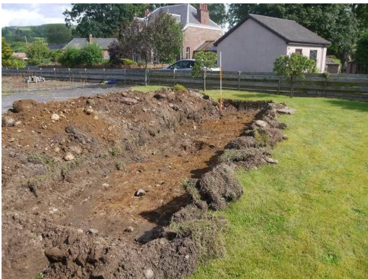
Illus 9 Trench 3 fully excavated looking North