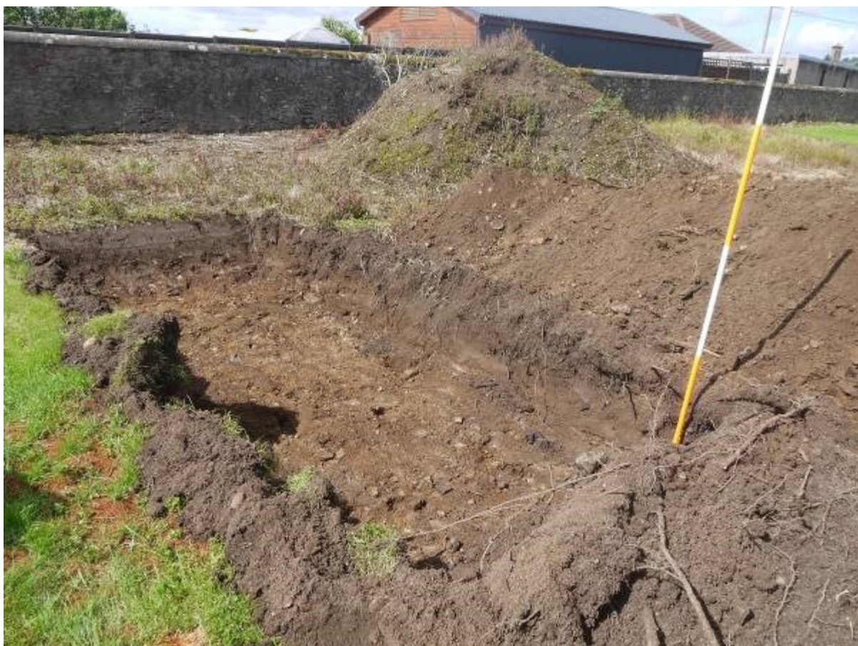
Illus 11 Trench 4 fully excavated looking North North West