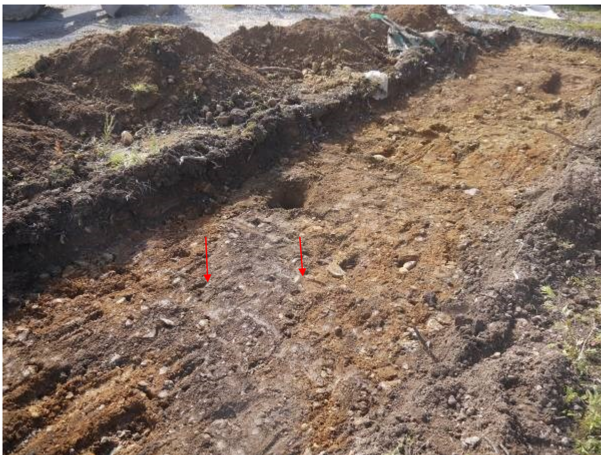
Illus 6 Detail view of South South Western end of Trench 1 with red arrows marking edges of linear feature 100 cut into natural gravel.