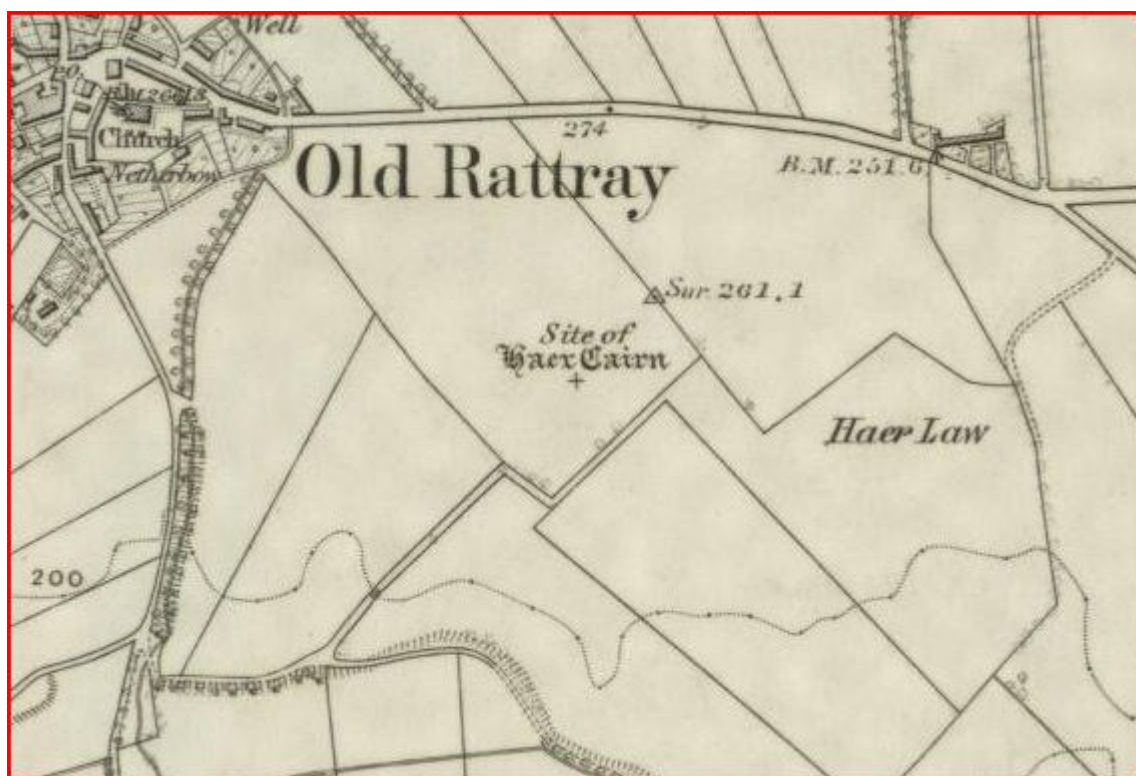
Illus 2 Location of the site of the Haer cairn as marked on First Edition Ordnance Survey map of 1867