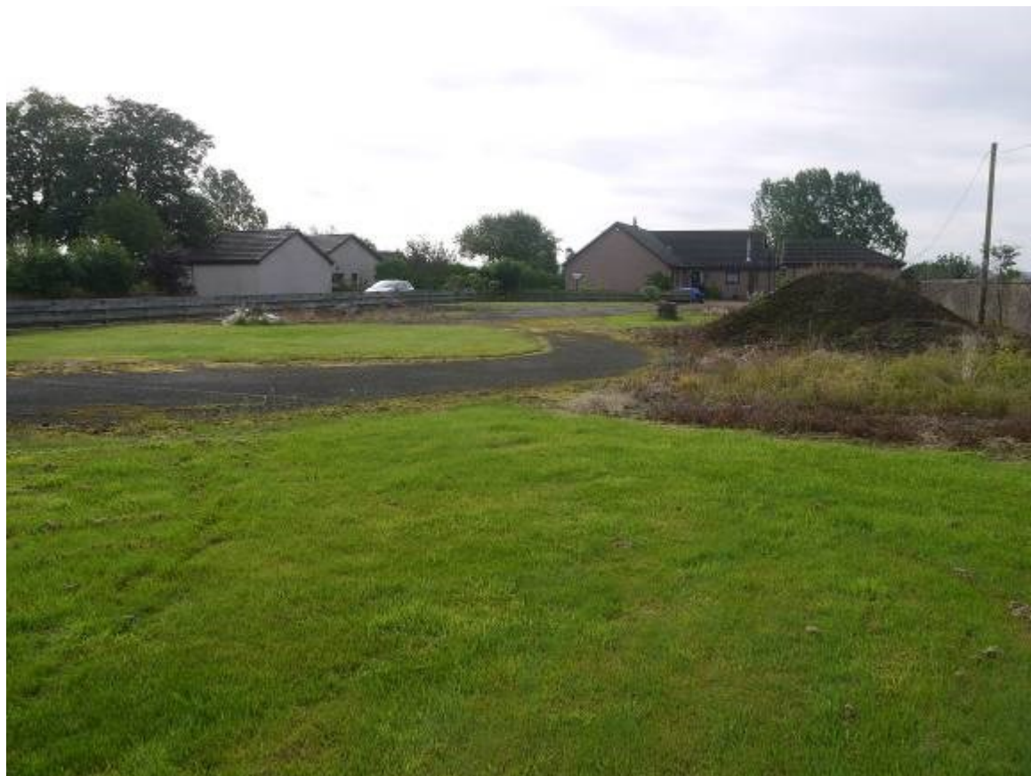
Site looking South with Glenara in background