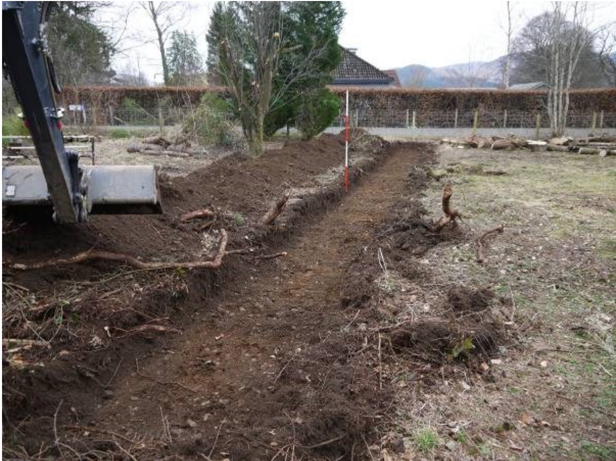
Illustration 8 Trench 3 looking North West showing orange brown natural gravel below grey brown silty clay