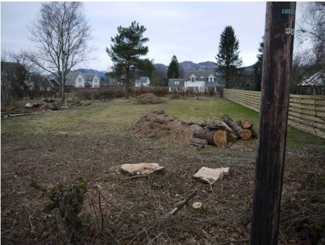
Site of new house looking North West