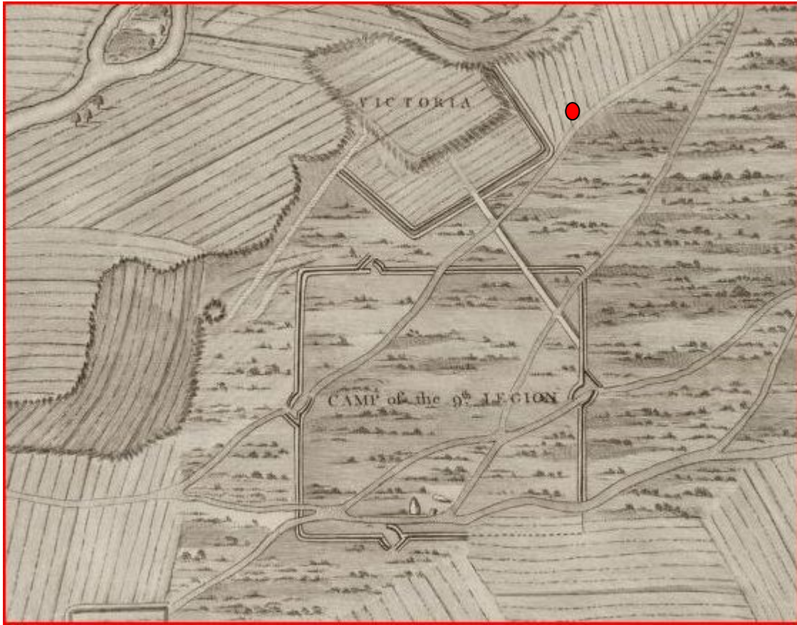
Illustration 2 'Victoria' on William Roy's Military Survey of Scotland 1747-55, red dot marks approximate location of site.