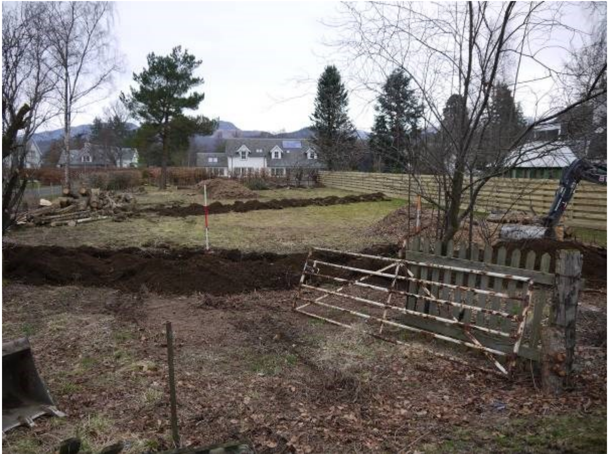
Illustration 5 General view of site looking North West showing location of three trenches opened.