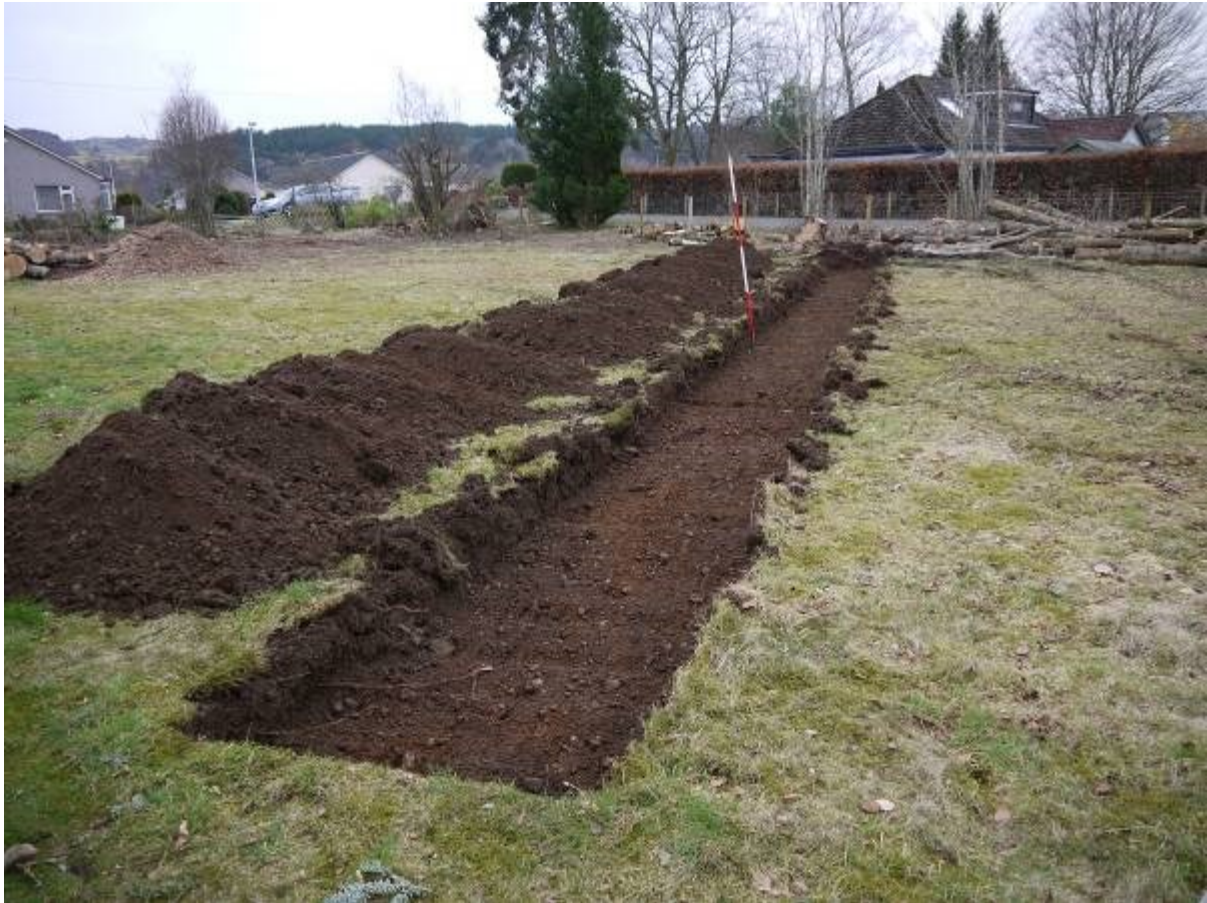
Illustration 7 Trench 2 looking south showing natural orange brown gravel below grey brown silty clay