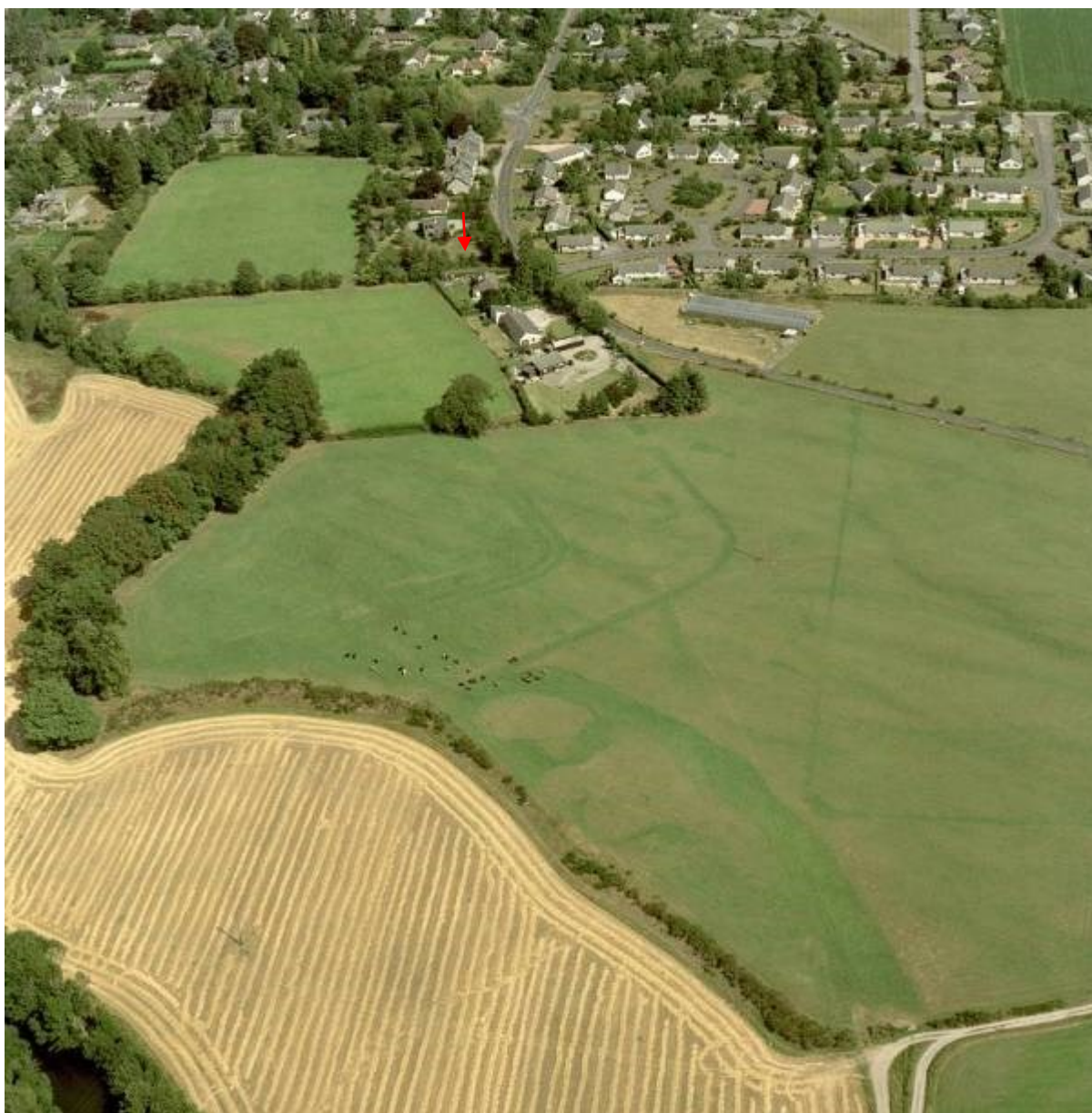
Illustration 3 Aerial photograph looking east showing cropmarks of Roman forts and temporary camp in foreground, site is shown with red arrow