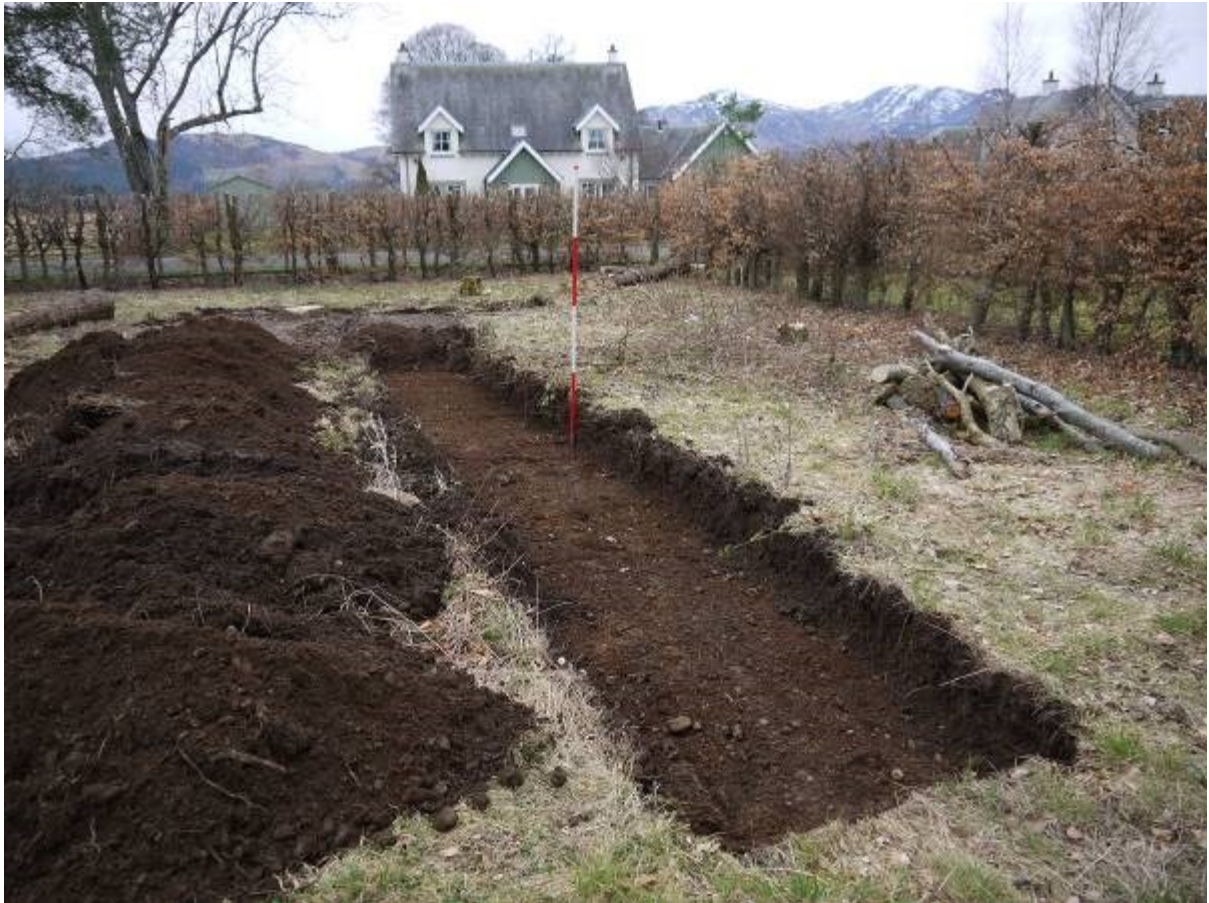
Illustration 6 Trench 1 looking west showing natural orange brown gravel below grey brown silty clay