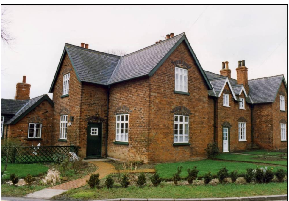
6-10 The Avenue, Great Coates - a former Grade III listed building

In 2010 work began on integrating the List of Buildings of Local Architectural or Historic Interest for Great Grimsby into the designations module of North East Lincolnshire's HER database. A Local List had existed for the former County Borough since 1973, as a reaction to the de-designation of the Grade Three listed buildings. Most of the buildings covered had good quality descriptions, backed up by the Ministry of Housing and Local Government's draft list for the borough which included descriptions of the Grade Three buildings even though they were to be de-designated as part of the update.