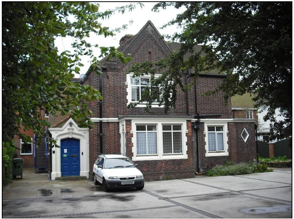
71 Bargate, Grimsby – Added to the Local List in 2009 with no description or selection criteria.

Advice was sought from the HER forum as to how to deal with these listings, and the opinion that they should still be in the HER seemed to be the dominant view, with the decision on their importance left to third parties. This, however, caused problems with the dilution of the pre-existing local list and the HER itself. As a small unitary authority, the Borough's record still only contains c.3200 monument records, and the remains of the 1973 list (with a couple of additions in 1990) amounted to just over 70 entries.