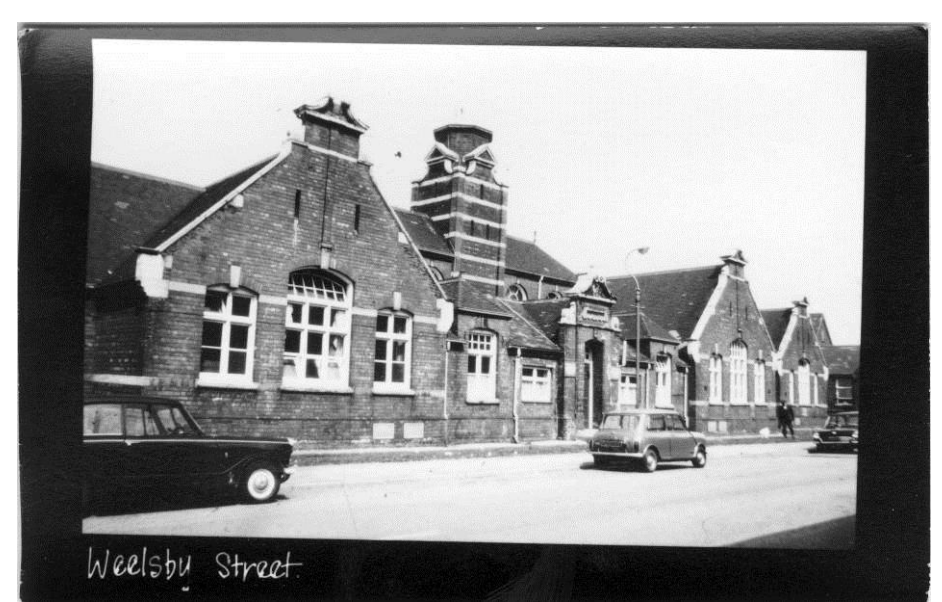
Weelsby Street School, Grimsby in 1972 – Although photographed as part of the survey for the 1973 Local List, it is absent from the 1982 amendment

Thirdly, two buildings could not initially be found because their street names and numbers had been changed following new road construction. It is important for HER officers to set themselves limits as to how far they will chase quirks like this, as hours can be spent just to find out that the building was demolished long ago.