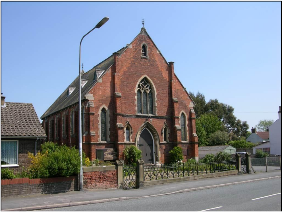
Waltham Methodist Church is marked as an "Essential" building in the Conservation Area Appraisal of 1976.

them as "essential", "of merit", "positive" or other similar phrases and titles, although the actual amount of information presented to justify these titles varies. As an enhancement project for the HER it may well be worth adding the contents of these lists to the HER as they can provide a valuable starting point for anyone looking at the specific details of what is important to the character of an area. These lists may also, depending on the way in which they were presented and incorporated into the appraisals, have similar standing in the planning process to more formal local lists.