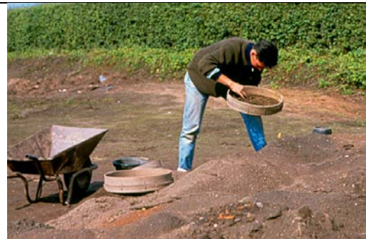
Figure 2: Sieving excavated spoil by hand.