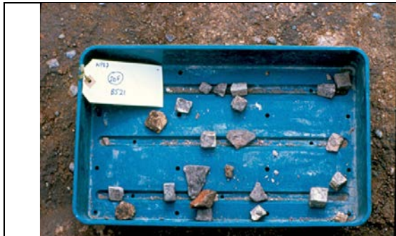
Figure 1: A labelled finds tray from the annexe. The label reads WP87 (20F) B521.

From 1970 all spoil was sieved to identify smaller objects that may have escaped notice during excavation, a policy adopted following research carried out by Sebastian Payne demonstrating the much enhanced rates of recovery for smaller animal bones as well as smaller objects such as beads, intagli and coins (Barker et al. 1997, 192; Figures 2, 3). Some objects were also recovered in the bulk soil samples taken for environmental processing and these were fed back into the system retrospectively. According to category, finds discovered while sieving would either be deposited in the appropriate tray or taken to be entered into the small finds system.