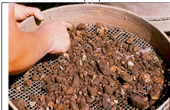
Figure 3: Typical dry-sieved spoil residue.