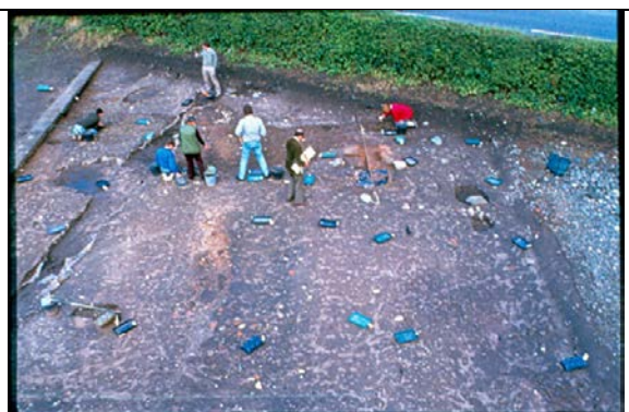
Figure 4: High level image of excavations in 1987 on Site A showing a trowelling line in operation. Note the regularly placed finds trays indicating the next two rows of 2.5m square finds grids.